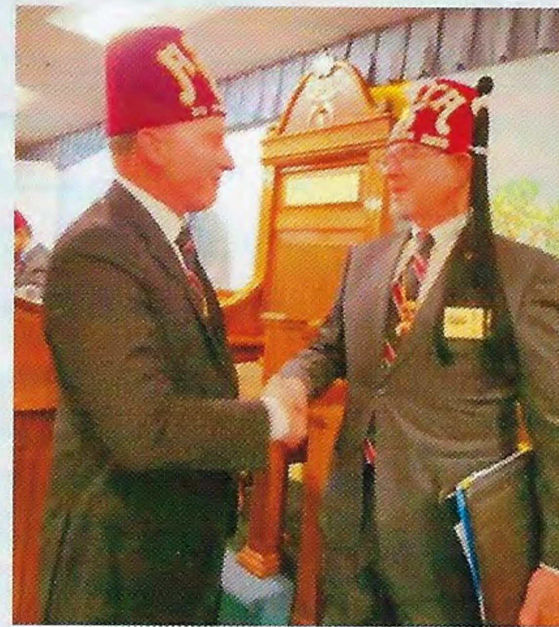
Passing the torch

There are so many memorable activities and countless Nobles and ladies to thank. But this article is not the place to do that (I am limited in text), and so I will close my remarks with two lines from two Nobles: