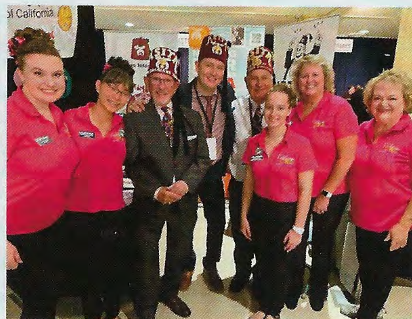
Always the most fun booth at the Annual Communications