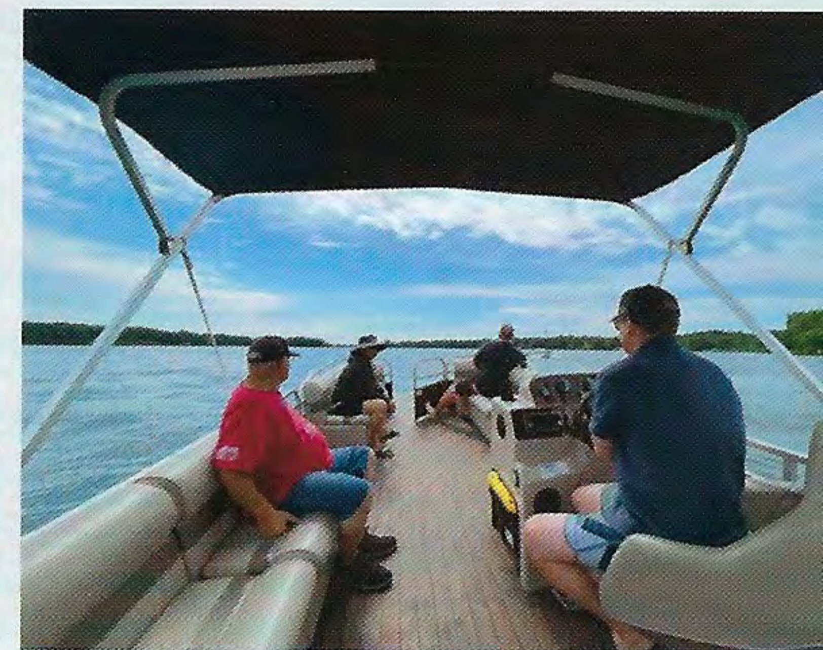
Ah...the healing powers of the Lake Minnetonka