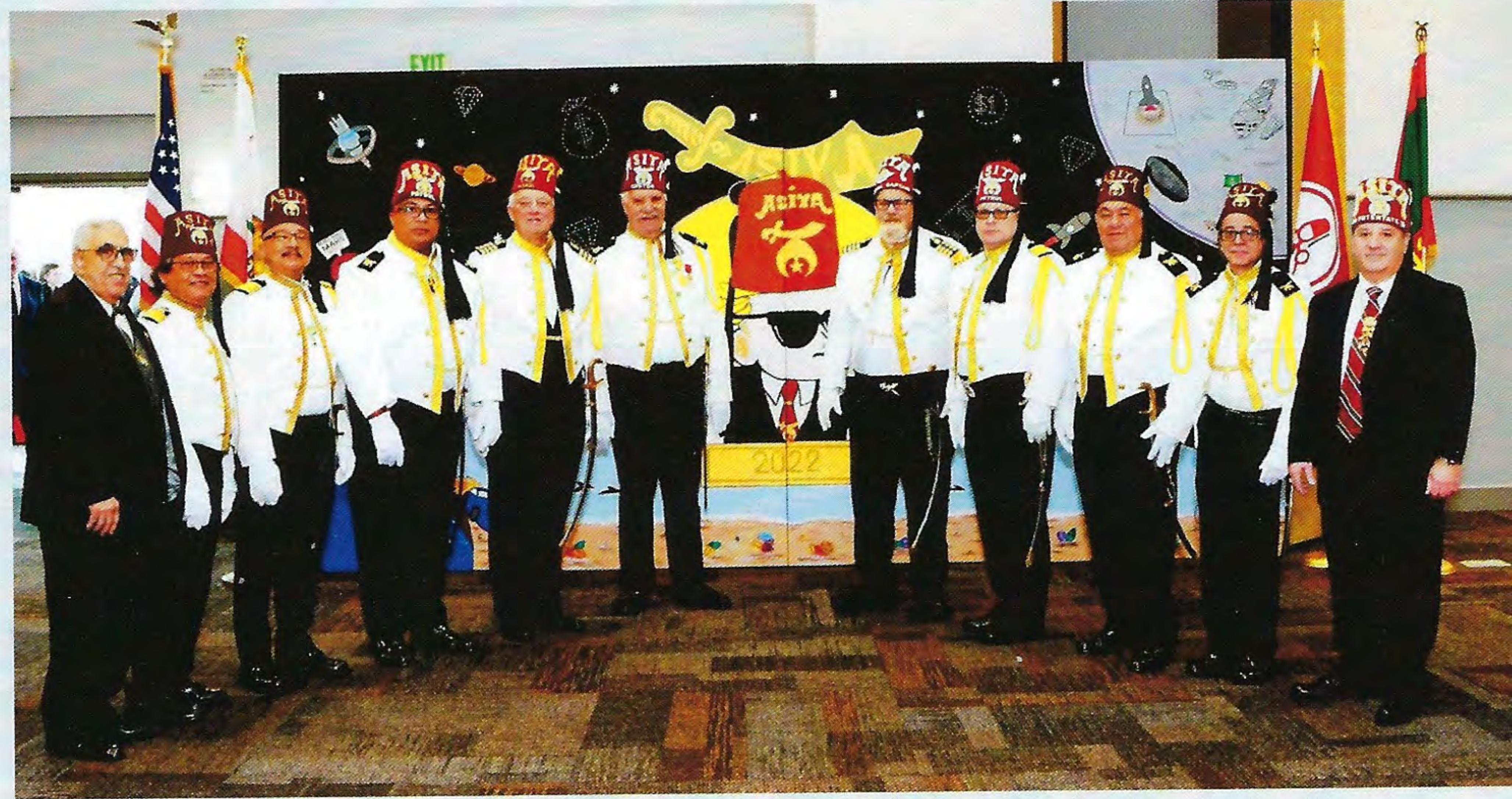
Asiya Patrol in all of its splendor

Asiya Shriners held two outdoor ceremonials "under the big top" in a tent in the parking lot with 4,000 pounds of sand, stage, lighting, sound, incredible performances from the Ritual Divan including the new Knickerbocker Degree, and the all new Asiya Shriners Tournament of Champions. I dreamt of an outdoor ceremonial in the sand many years ago, but never dreamt it could be as big as it turned out—thank you for joining me in trying something new and proving that there is nothing finer than to be an Asiya Shriner!