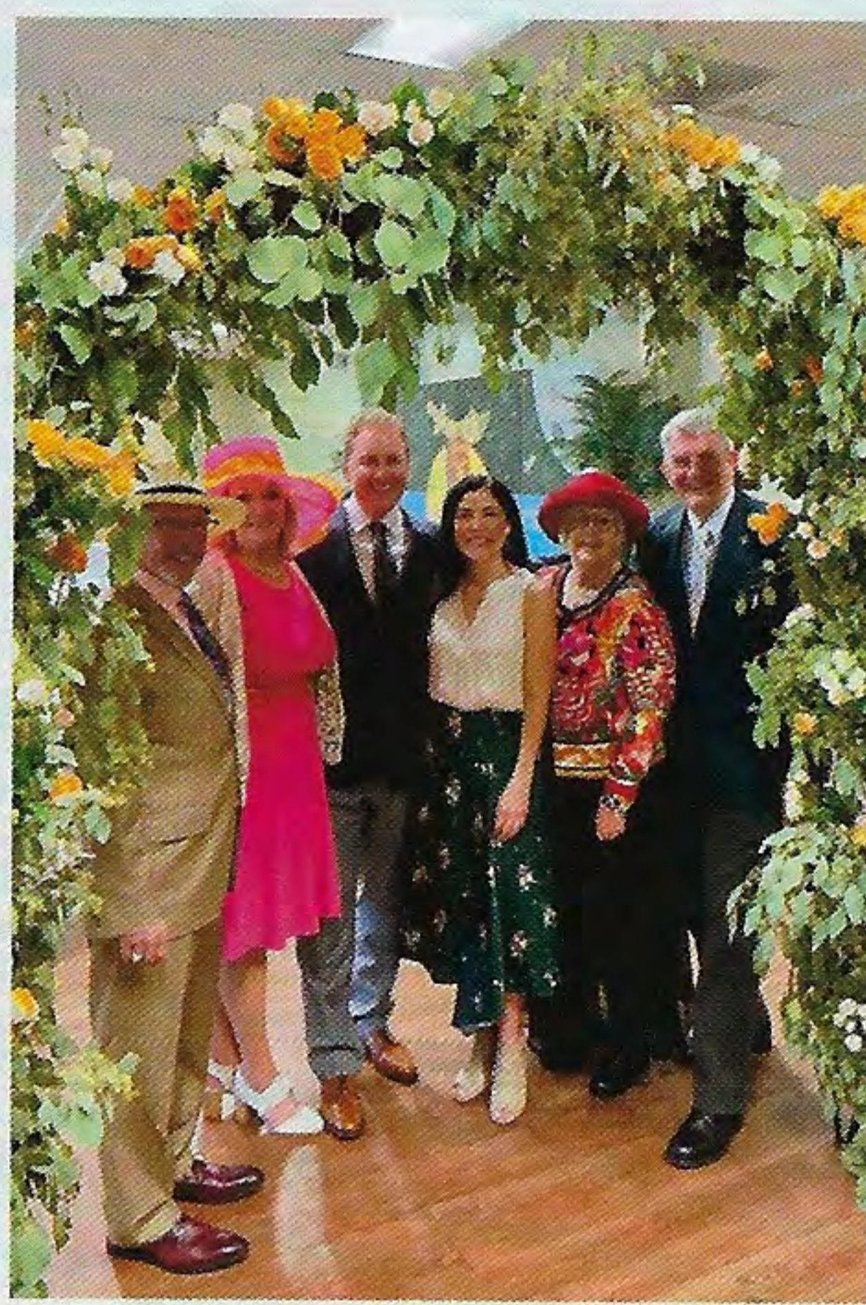
Flower power in full bloom