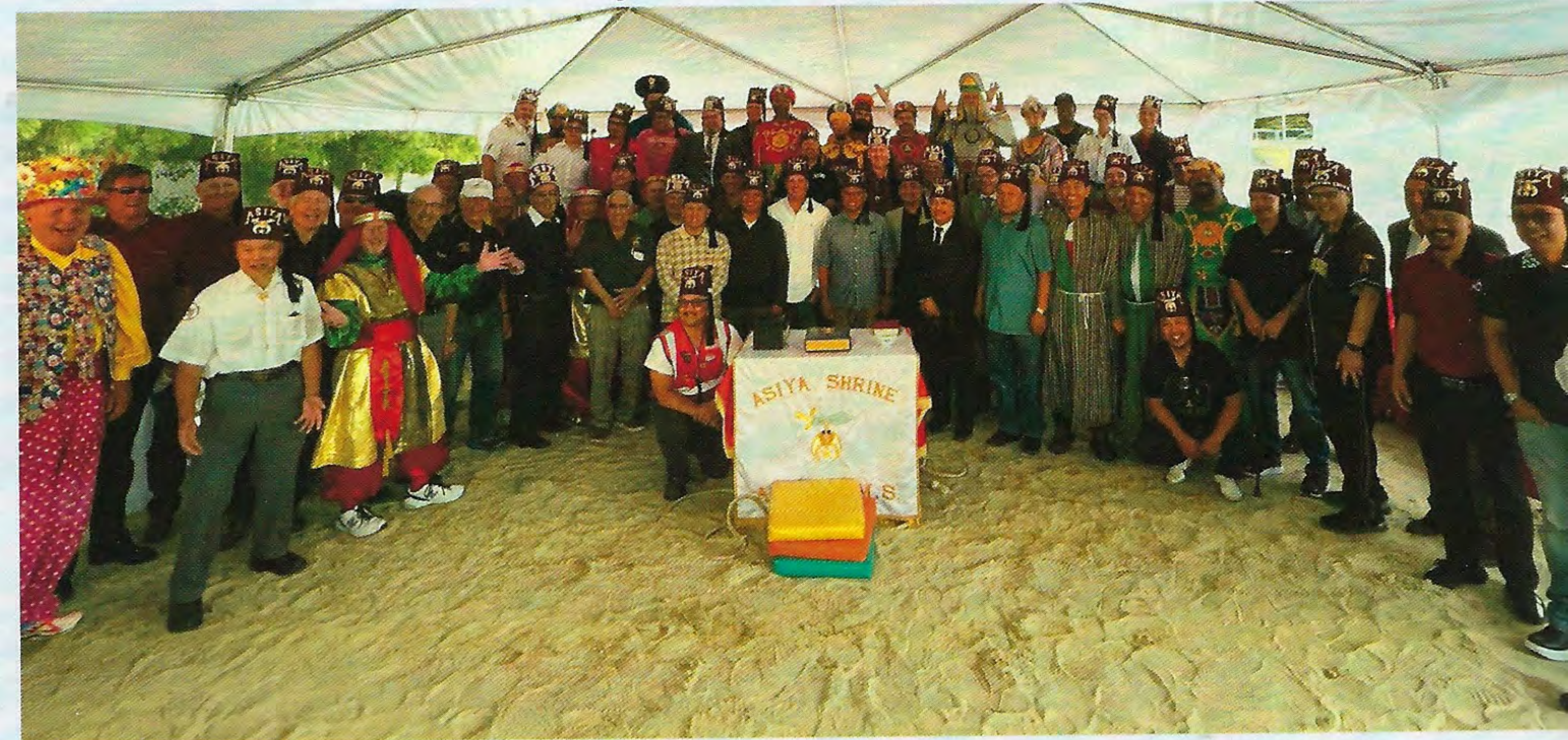
Spring Ceremonial Class after passing through the real sands of the desert

Asiya Shriners held two outdoor ceremonials "under the big top" in a tent in the parking lot with 4,000 pounds of sand, stage, lighting, sound, incredible performances from the Ritual Divan including the new Knickerbocker Degree, and the all new Asiya Shriners Tournament of Champions. I dreamt of an outdoor ceremonial in the sand many years ago, but never dreamt it could be as big as it turned out—thank you for joining me in trying something new and proving that there is nothing finer than to be an Asiya Shriner!