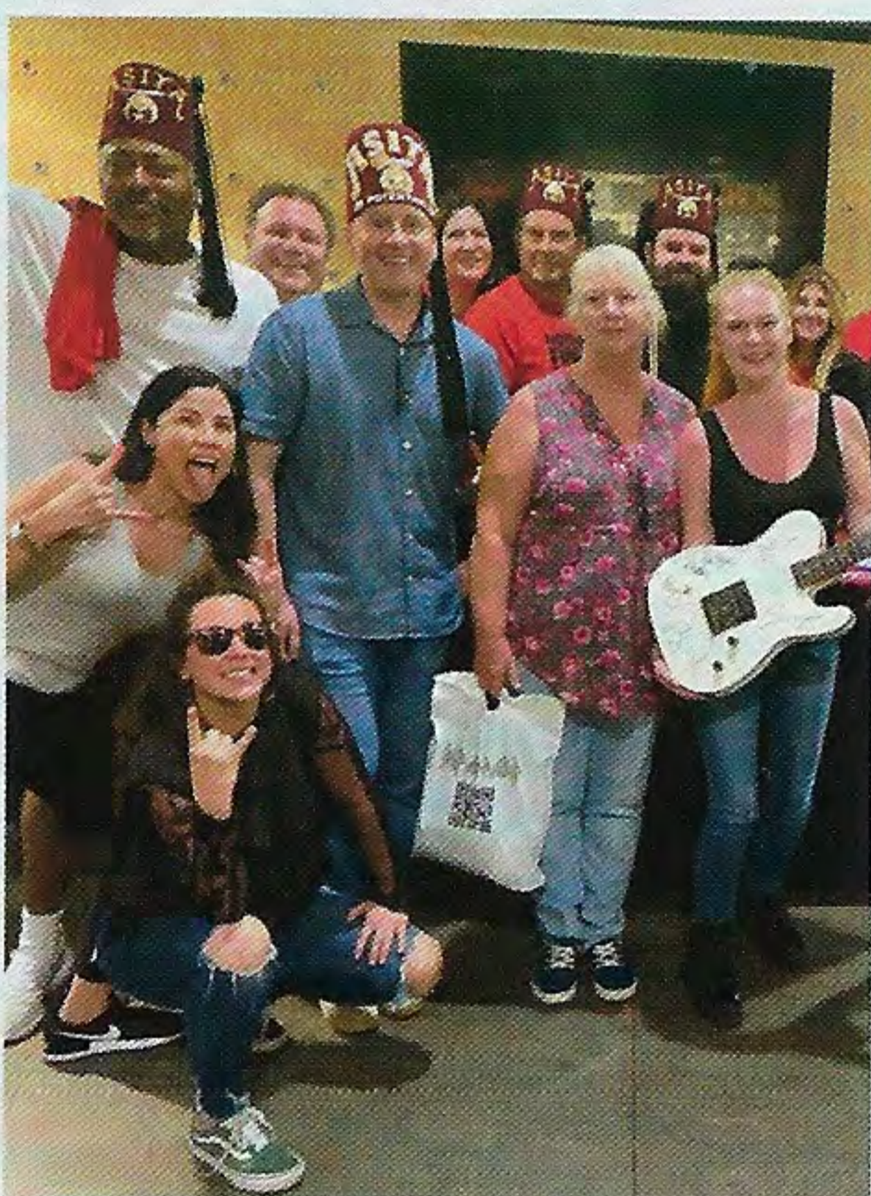
Rockin' for a cause!

There are so many memorable activities and countless Nobles and ladies to thank. But this article is not the place to do that (I am limited in text), and so I will close my remarks with two lines from two Nobles: