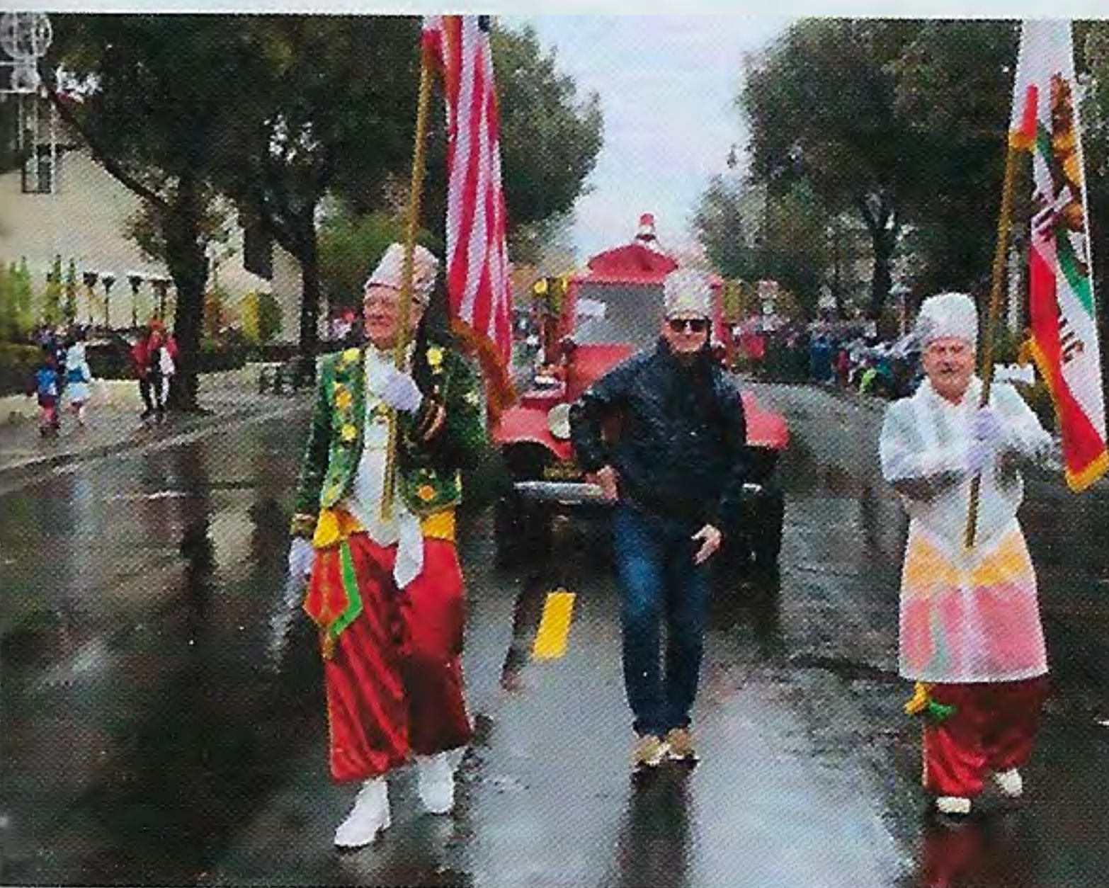
Marching on...rain or shine!