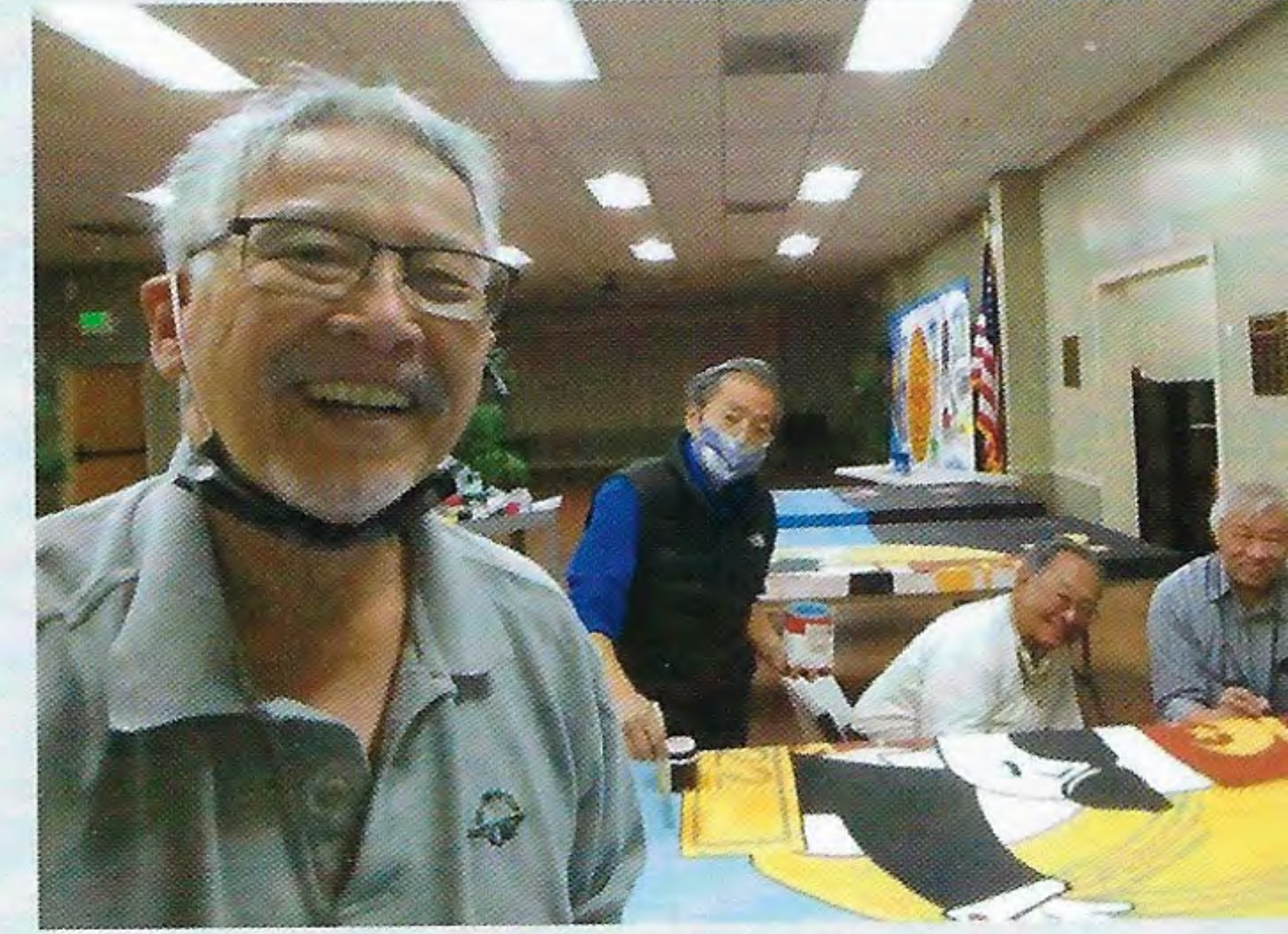
The Nobles behind the legendary mural

The year started with the unveiling of a magnificent backdrop at the Mass Installation, painted by the Asiya Shriners Section Crew unit, with the Divan and unit and club leaders parading through a magnificent honor cordon by the Asiya Shriners Patrol unit.