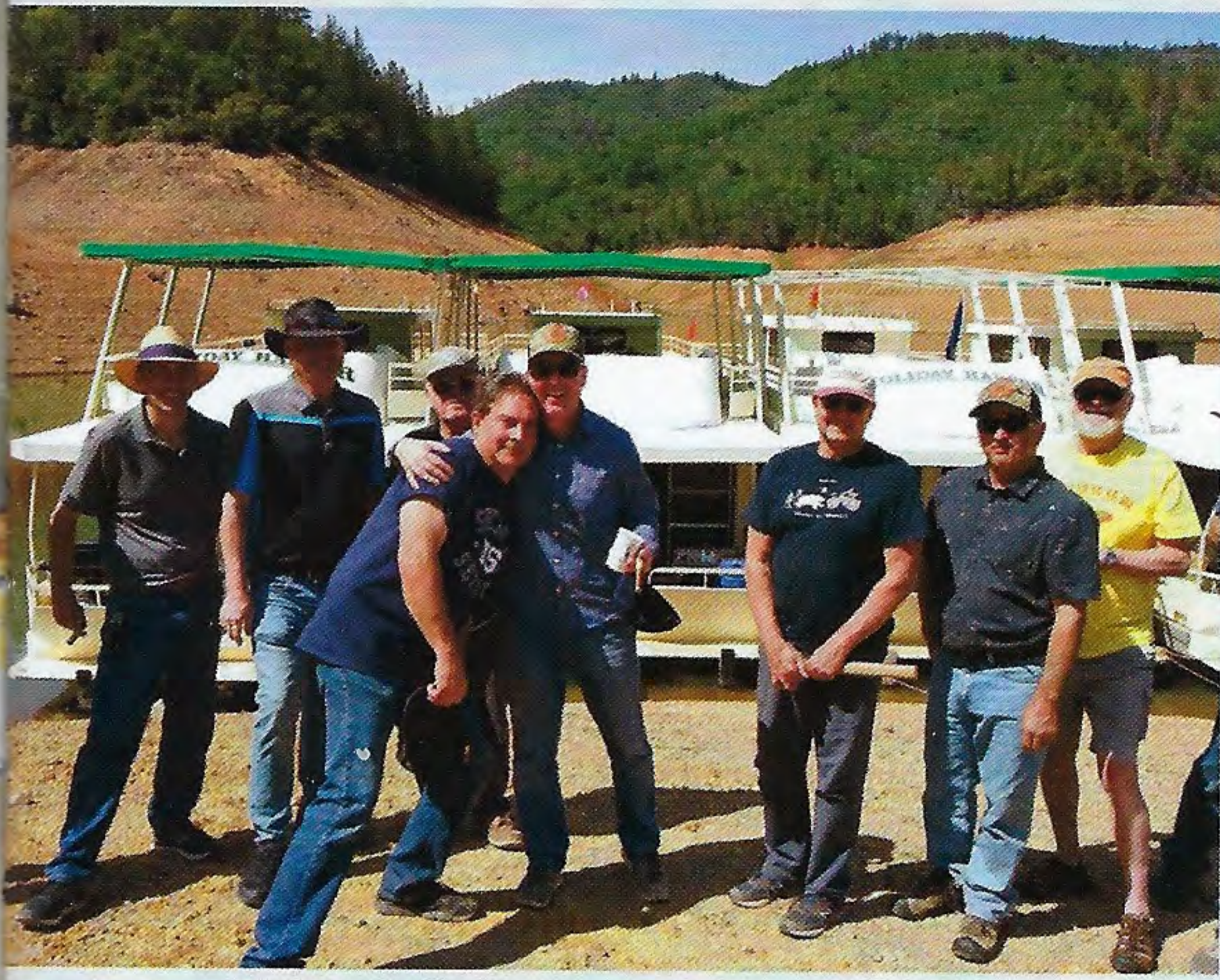
R&G Annual Shasta Trip was a blast