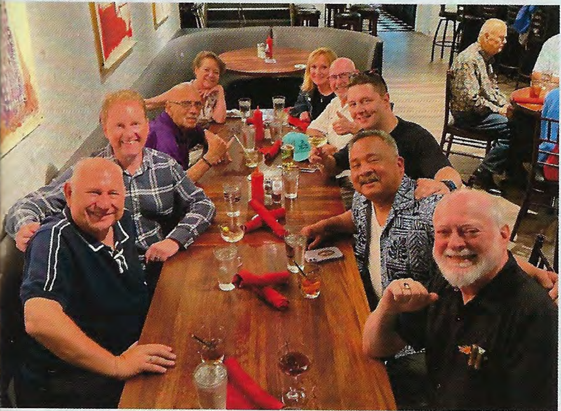
Famished and ready to feast after a long day at the Imperial Sessions