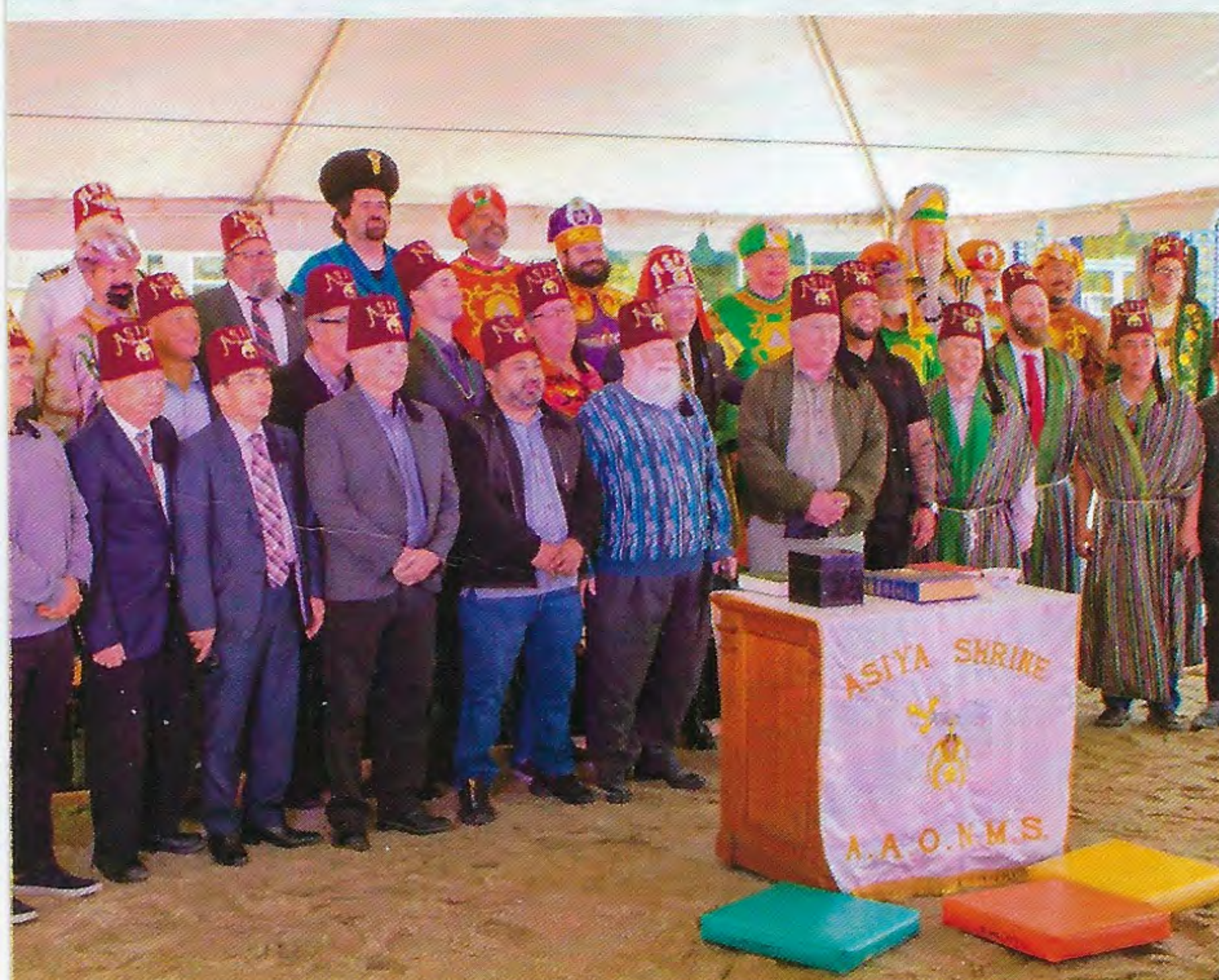
We doubled the sand for the Winter Ceremonial!