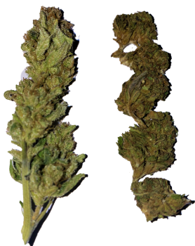
Ours vs Theirs

We cure the products to reach the perfect combination of sticky and full-bodied. Gently press your fingers against the bud and you'll feel the evidence how precision environmental control yields a dispensary-grade flower that keeps its character.