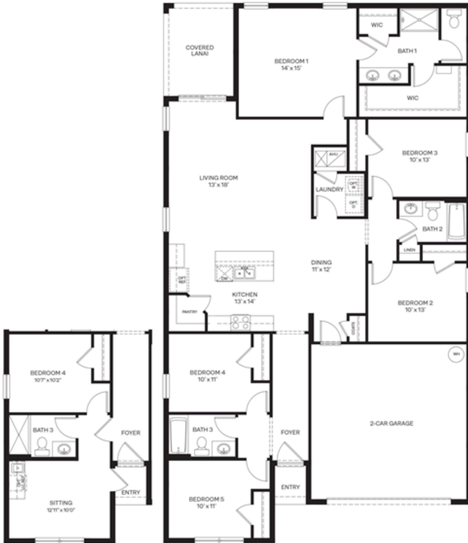
OPT. MULTI-GEN SUITE