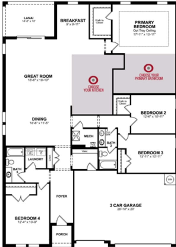
Floor Plan Depicts the Spanish Colonial L Exterior