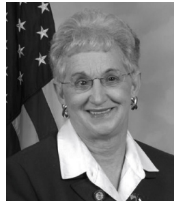
Senator John Barrasso CHAIRMAN