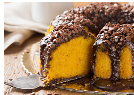
Chocolate Carrot Cake