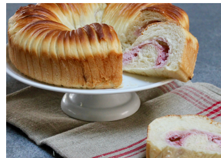
Whole Wool Bread