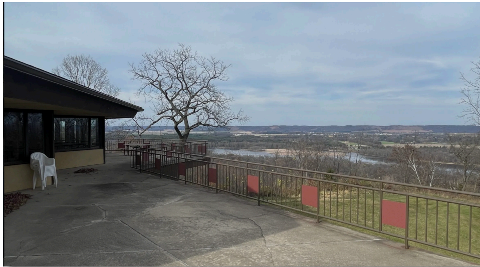
The view from the top at Wintergreen