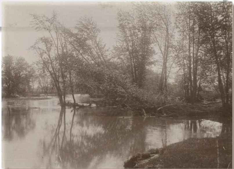
Sugar Creek circa 1899

“But that which crowned the perfection of the view, and imparted an indescribable charm to the whole scene from the knoll where we stood, to the most distant point, was the inimitable grace with which the picturesque clumps of trees, that sometimes enlarges themselves into woods, embellished this rural landscape from the hand of Nature. America will justly boast of this unrivaled spectacle when it becomes known, for certainly it is formed of elements that no magic could enable all Europe to bring together upon so great a