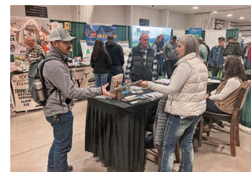
Exhibitors at the Willamette Valley Ag Expo.

Dine Around Oregon is presented by N & S Tractor.