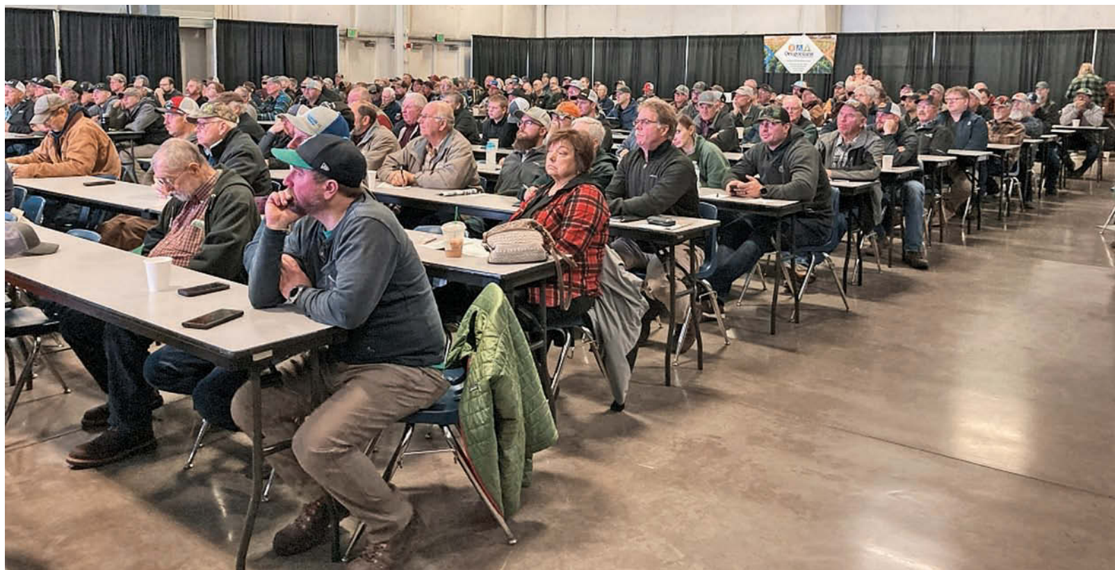
Four free core pesticide credits will be available at the Willamette Valley Ag Expo.