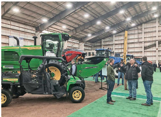
Exhibitors at the Willamette Valley Ag Expo.

full slate of informative and entertaining events.