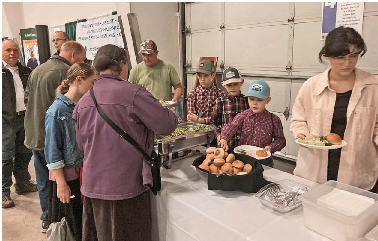
Dine Around Oregon is a progressive dinner during the Willamette Valley Ag Expo.

This year's dinner will include special entertainment. At 7, Harris Stockdogs will present a special demonstration, and a country-folk group will serenade diners in the Cascade Building.