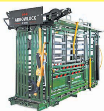
New 88 Series In-Stock!

Western Oregon, Washington & No. California distributor of the Arrowquip Livestock Handling System