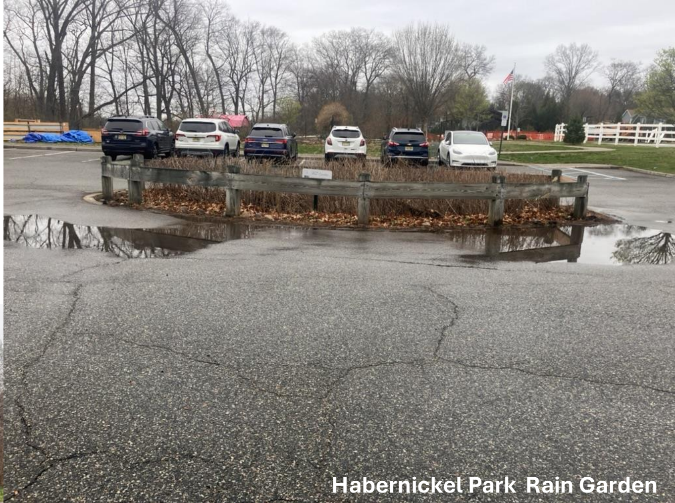
Habernickel Park Rain Garden

With the support of volunteers from Grace Church, the gardens will be cleaned of debris, repatched for better drainage and replanted.