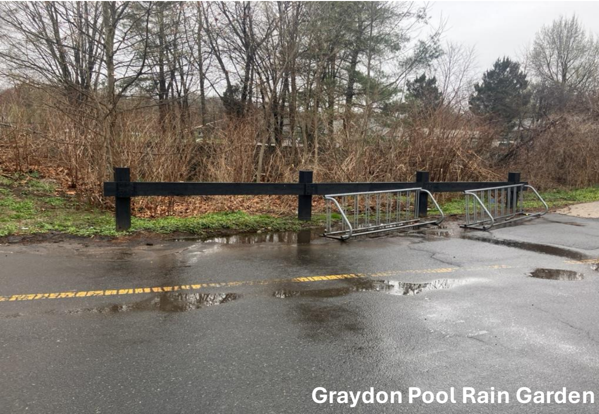
Graydon Pool Rain Garden