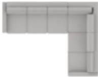
12/40 125 x 96" 318 x 244 cm