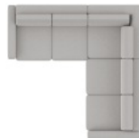
07/40 99 x 96" 252 x 244 cm