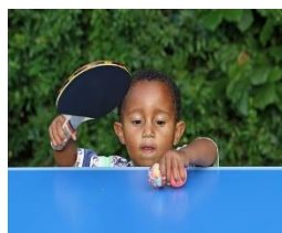
TABLE TENNIS CAMP