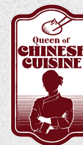
Queen of Chinese Cuisine