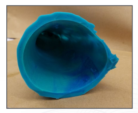
Confirm adequate thickness prior to cast removal. (Should be ^{1}\!/_{_{2}} inch thick)