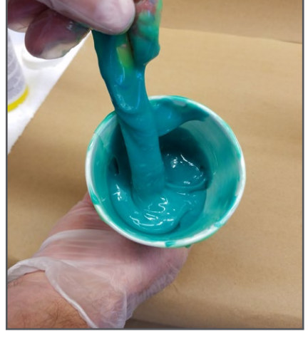
Measure equal parts of Smooth On casting material, and then blend thoroughly.