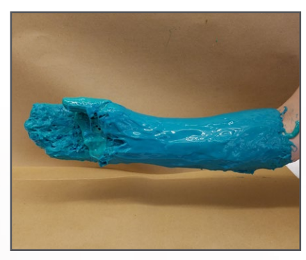
Apply casting material to limb, and thoroughly cover limb with the first coating.