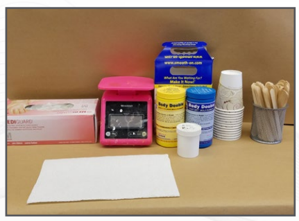
Prep area for casting and gather all required materials.