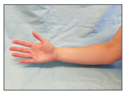
Instruct patient on proper hand positioning prior to casting: