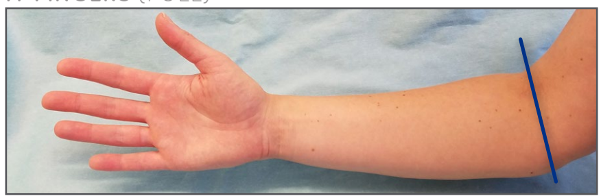
Up to the cubital fold