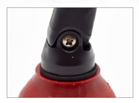
Disassemble M-Thumb by removing the Phillips screw on the side.