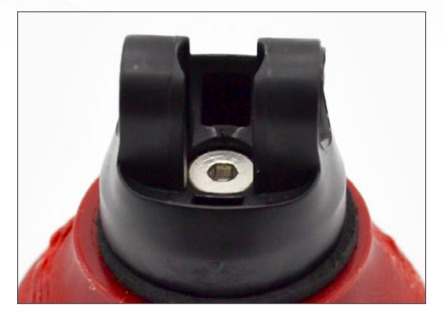
Install thumb base and screw through center hole. Tighten with 3/32" Allen wrench.

Note: Loctite 242 may be applied to secure the rotation set screw.