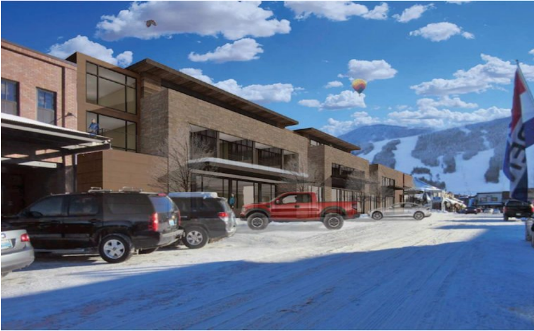
CENTER STREET HOTEL, JACKSON, WYOMING