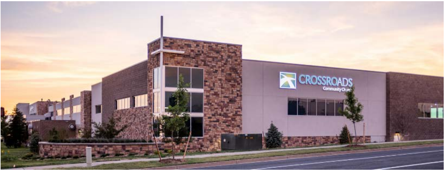
CROSSROADS COMMUNITY CHURCH, FACILITY EXPANSION, PARKER CO