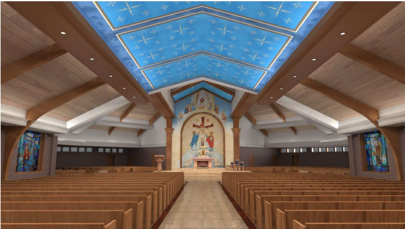
ST MARY CATHOLIC CHURCH, WORSHIP CENTER REMODEL, LITTLETON, CO