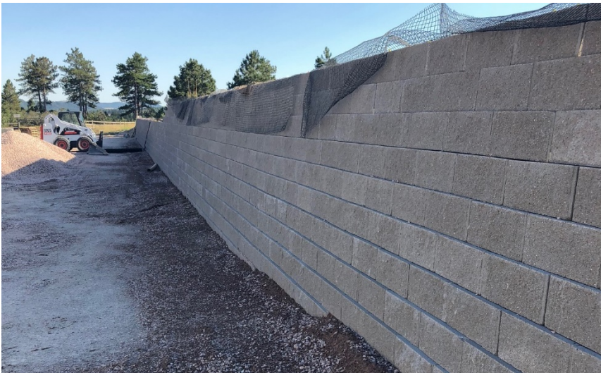
ASPIRE OUTDOOR HORSE ARENA 2000 s.f MSE RETAINING WALL, LARKSPUR, CO