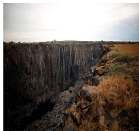
Low-water levels are seen after a prolonged drought at Victoria Falls, Zimbabwe on December 4, 2019. The worst drought in a century has slowed the iconic Victoria Falls to a trickle, fueling fears that climate change could kill the tourist attraction on the border between Zimbabwe and Zambia.

Many of you have generously donated to this cause, and we were successful in funding the construction of a new well that will bring fresh water to a community of more than 1000 residents. Our team will be meeting with this