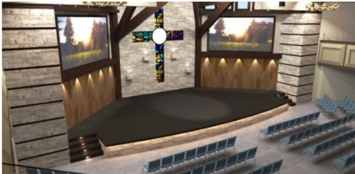
GREENWOOD COMMUNITY CHURCH, SANCTUARY REMODEL, GREENWOOD VILLAGE, CO