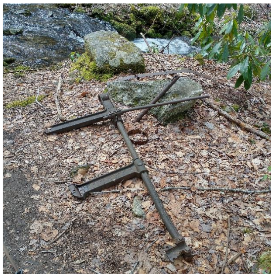
Some of the parts at the ...