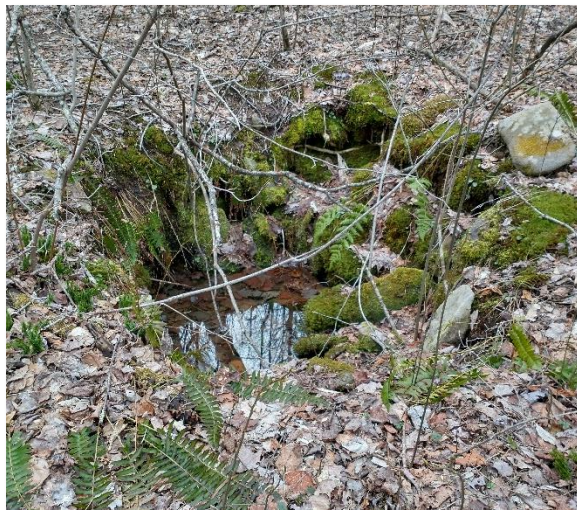
Remains of a well.