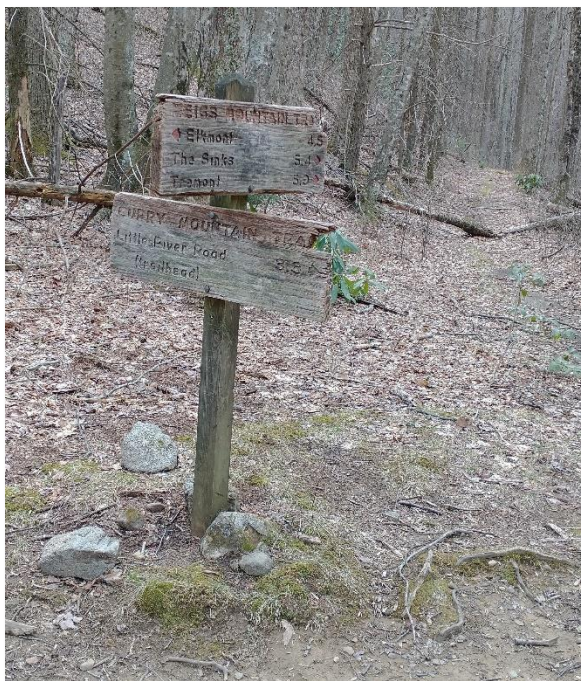
Curry Mountain Trail Junction

Someone also lived here. The rockwork is what's left of a fireplace and chimney.