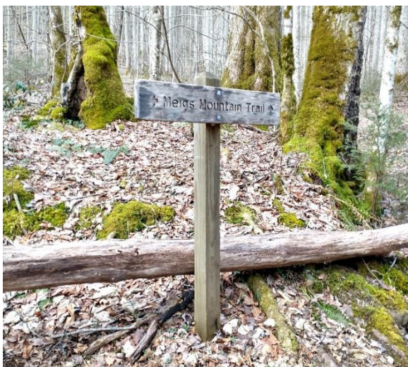
Meigs Mountain Trail Sign at the wall along the manway from the Stable.

The photos below are from multiple hikes and possibly contributed by more than one hiker.