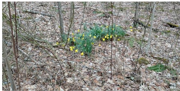
Daffodils, clear signs of former home site. Definitely not native wildflowers...