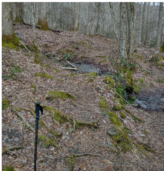
Meigs Mountain Trail straight ahead, stone wall leading to tree, manway from stable on the right.