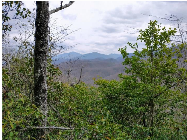
View from trail on East flank of Curry She Mountain