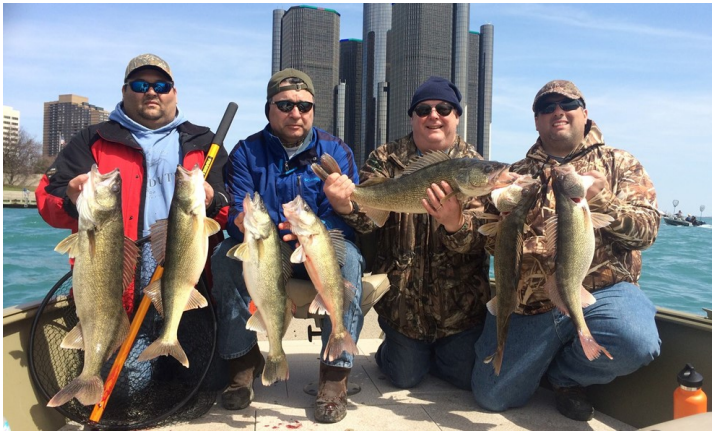
FISH HEADZ ....Doing it in the 'D'