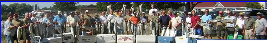
Detroit Area Steelheaders