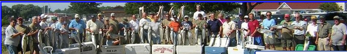
Detroit Area Steelheaders