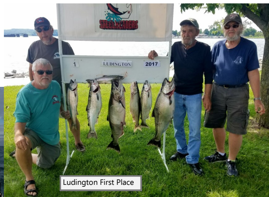
Ludington First Place