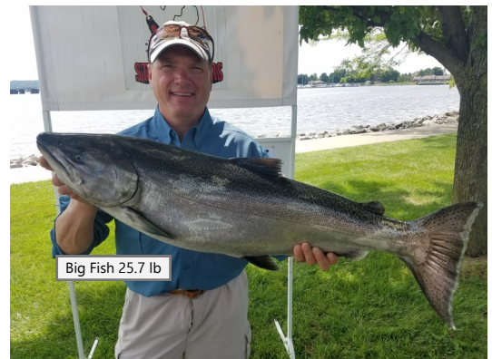
Big Fish 25.7 lb