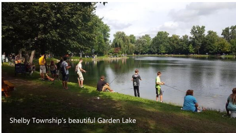
Shelby Township's beautiful Garden Lake