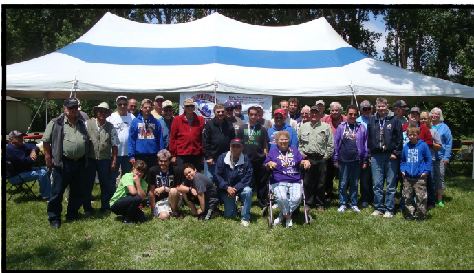
A Group Photo from 2015's Special People Outing