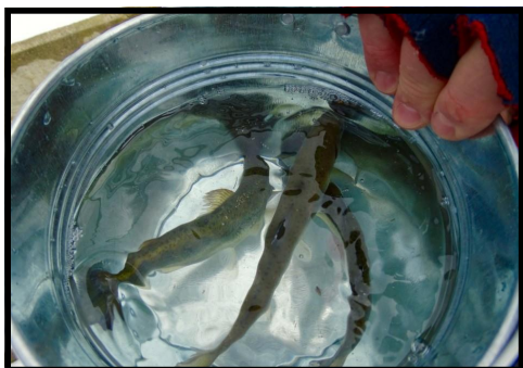
Coho salmon fingerings at the Platte River State Fish Hatchery on Monday, April 4, 2015 during a 50-year anniversary celebration of Michigan's Pacific salmon stocking program initiated in 1966.

on April 06, 2016 @8:35AM, updated April 06, 2016 @ 8:36AM