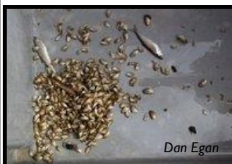
Pickings were slim for the researchers doing their annual trawling survey on the bottom of Lake Michigan