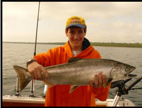
Chinook Salmon can still be caught in Lake Huron but the fishery has shifted to Walleye in some areas and a mix of salmon and trout species in others.

estimates there may be around three or four times as many fish. The walleye are big and “they showed up early,” Farden notes. During one recent weekend, he notes, the fishing was so good that there was scarcely a night crawler to be had in the area.