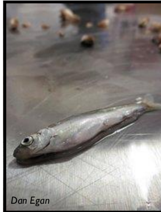
One of the nets pulled during a Sept. 23 expedition off Port Washington yielded this single chub.

Biologists blame the plummet in prey fish on a number of factors, not the least of which is that the