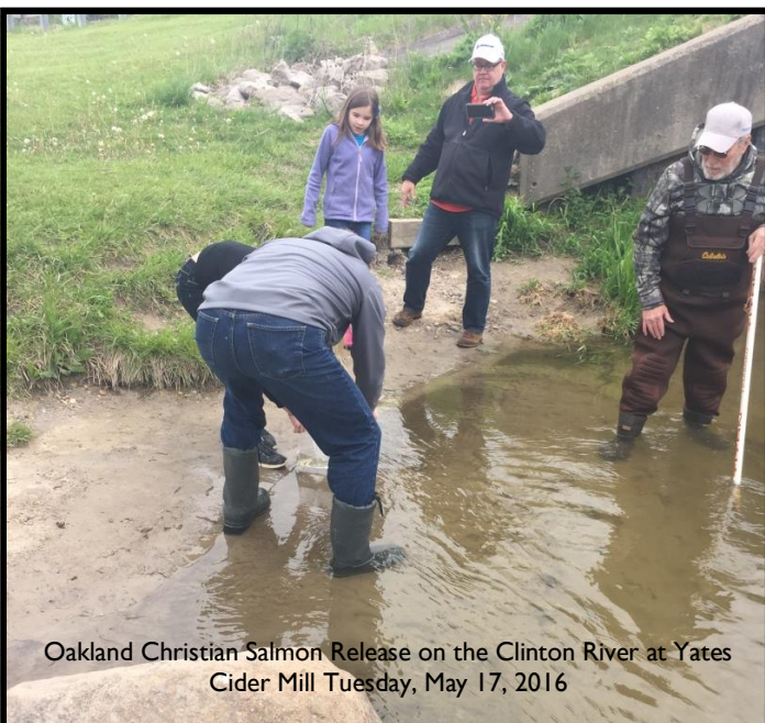
Oakland Christian Salmon Release on the Clinton River at Yates Cider Mill Tuesday, May 17, 2016