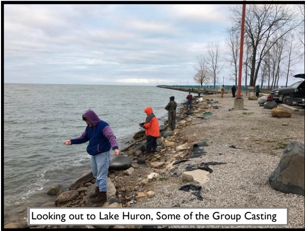
Looking out to Lake Huron, Some of the Group Casting