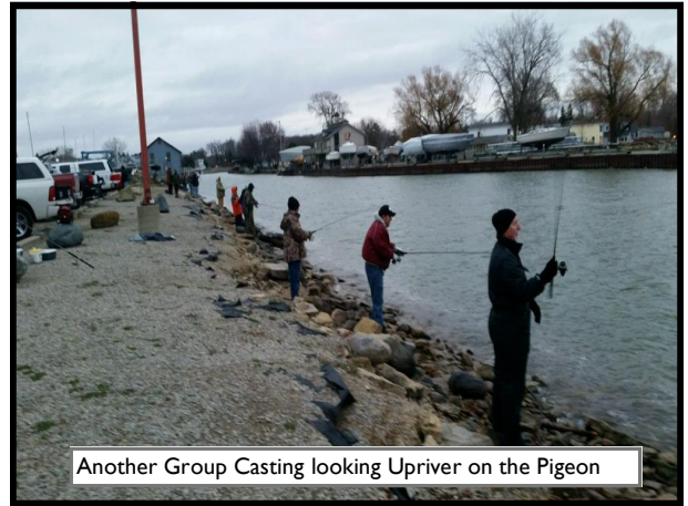
Another Group Casting looking Upriver on the Pigeon