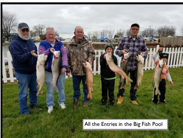
All the Entries in the Big Fish Pool