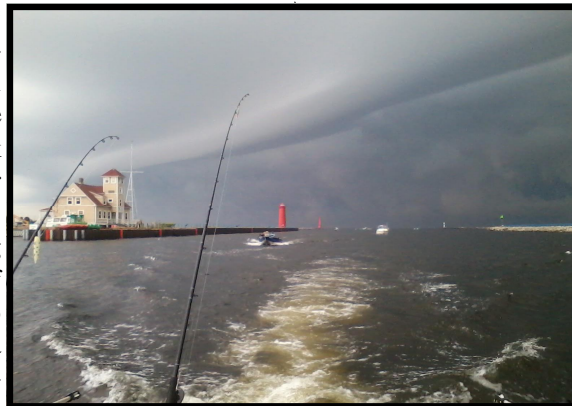
A neat shot of the approaching storm that delayed the Muskegon tournament.

Several boats got to Muskegon early and attempted to fish on Friday. It was crystal clear skies, sunny and 85* cruising from the marina, out on Muskegon lake and even in the channel, but fog as thick as pea soup had other plans for us that day on Lake Michigan, keeping even the big dogs off the lake. Needless to say there was then a lack of first hand fishing intel for the tournament.