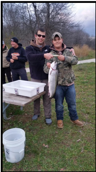
Manistee Photos Nov. 7, 2015