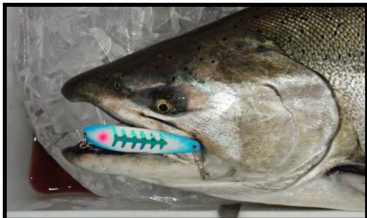
State Fisheries Managers Say Today’s Smaller Salmon Fishery is More in Balance with Food Available for Them to Eat.