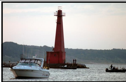
Lake Michigan Salmon Anglers trolling for Salmon off the Port of Muskegon this past spring