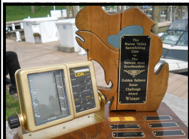
The first-ever 'Golden Salmon Sonar Challenge' travelling trophy captured by the DAS

Probably, unusual would best describe the fishing the DAS boat trollers experienced at St. Joe for the first tournament of the 2013 season. Fishing conditions were good for the tournament start with 10-20 waves with an offshore wind. Some boats found plenty of coho & small steelhead out in 97 to 115 deep water. Other boats found some kings in 40 to 60 but not too many of them. What was surprising was the size of the kings, especially for the spring time.