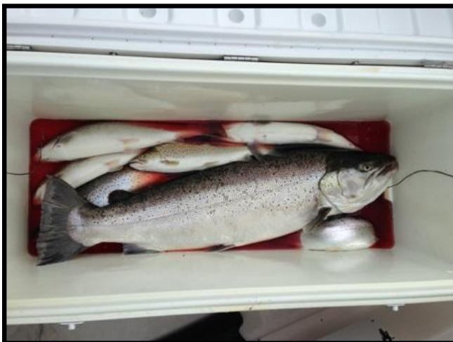
'The Brown' in a 162 qt. cooler

Here's the details on that Big Brown! It was caught on Monday, 5/5/2014 in 8 foot of water just south of Ludington pump station known as the Project. It hit a Storm Thunderstick called Mad Flash. The Battle lasted for 37 minutes. When the Brown finally came aboard, it officially tipped the scale at 30.14 pounds and was 38 and a half inches long and almost 10 inches thick.