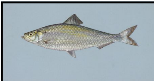
Alewives, the primary forage for Chinook salmon in Lake Michigan.

ANN ARBOR – Lake Michigan's prey fish population grew in 2012, but not enough to put aside concerns about the potential for collapse, according to federal scientists who conduct annual prey fish assessments on the Great Lakes.