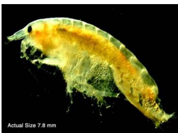
The shrimp-like diporeia is an energy-rich food source for alewives.

Predation has also intensified. Salmon now eat greater numbers because they are smaller and less energy-rich, Madenjian said. Scientists think that change is due to the disappearance of diporeia, a tiny, energy-dense shrimp-like creature that was an important part of the alewife diet. Their disappearance is thought related to the presence of zebra and quagga mussels in Lake Michigan which filter out important phytoplankton that diporeia feed upon. The exact reason for their disappearance is not known, according to Madenjian, but the outcome is that alewives are less energy-rich and so salmon eat more to meet their caloric needs.