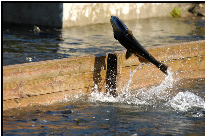
A Chinook salmon in the retention ponds at the Little Manistee River egg take facility operated by the MDNR.

The second theory is that wild salmon are migrating into Lake Michigan from Canadian waters in Lake Huron. Researchers roughly estimate that Canadian waters produce 14 million wild smolts every year. Just how many make to Lake Michigan is unknown.