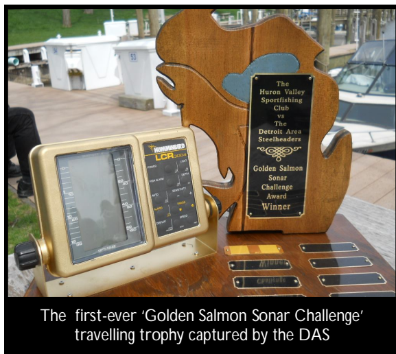
The first-ever 'Golden Salmon Sonar Challenge' travelling trophy captured by the DAS