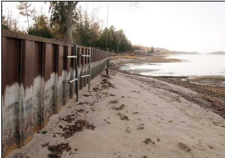
In this Nov. 16, 2012 photo, the white streaks on a steel break wall show the normal water level on Portage Lake at Onkama, Mich., which is connected by a channel to Lake Michigan.

With lake levels at their lowest point since the mid-1960s, Snyder said the specter of recreational and commercial fishing boats being unable to get in and out of harbors requires an "urgent or emergency kind of option." A likely option is dredging harbors, canals and waterways that connect to the lakes, some of which haven't been dredged in decades. "A lot of Michiganders don't realize that lake levels are extremely low," Snyder said at the Michigan Press Association conference in Grand Rapids. "It is critically important to tourism and other things in Michigan, in terms of normal business and commerce."