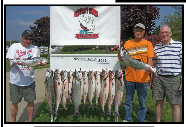
1st Place - "Vickie's Seacret"