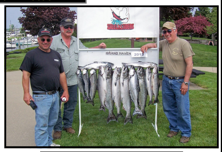
2nd Place - "Blue Horizon"