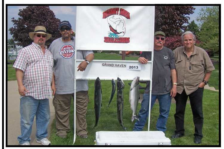
8th Place - "Loki One"