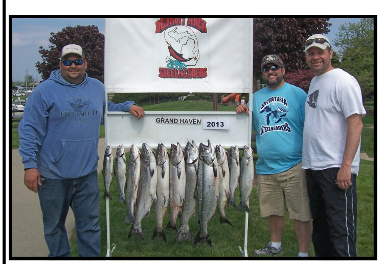
3rd Place - "Nite Moves"