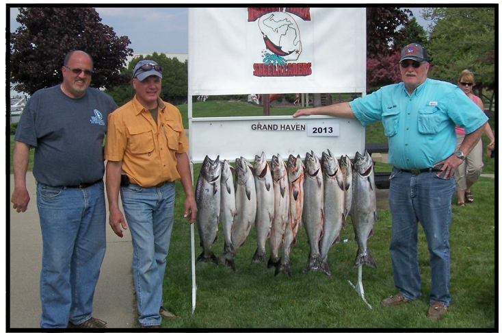
4th Place - "Bad Dog"