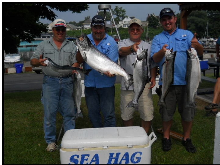
1st Place - "Sea Hag"