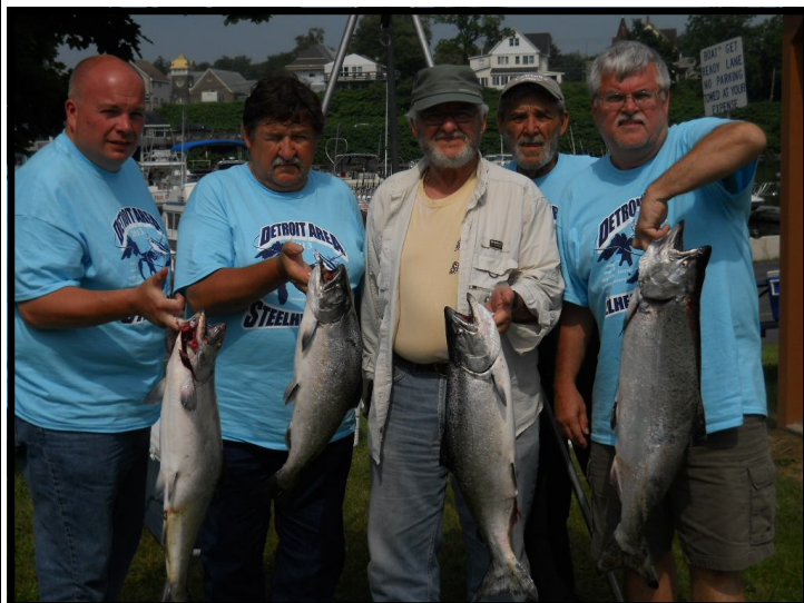
3rd Place - "Sloppy Joe"