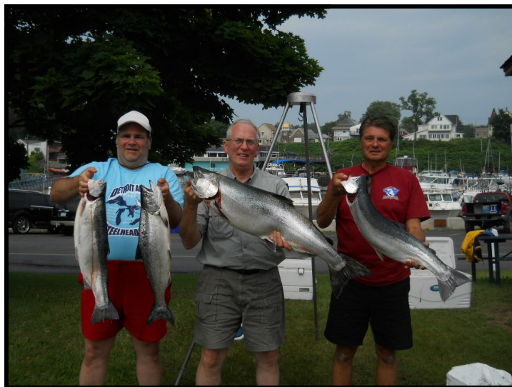
2nd Place - "Vickie's Seacret"