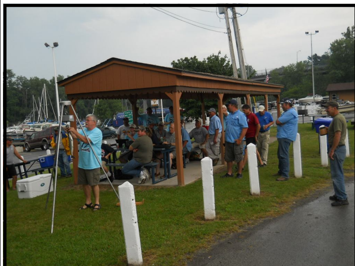
The skippers and crews observing the weigh-in.