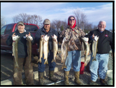
A morning's catch at a Caseville outing

For those who do wish to try the end of the pier, you will be able to catch some dandy Walleye and Steelhead, just remember to release any lake trout. Caseville trout are in the harbor feeding on