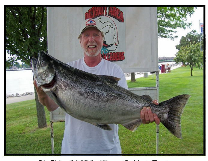
Big Fish - 26.35 lb. King - "Bobby's Toy"