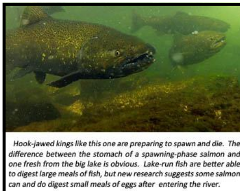
Hook-jawed kings like this one are preparing to spawn and die. The difference between the stomach of a spawning-phase salmon and one fresh from the big lake is obvious. Lake-run fish are better able to digest large meals of fish, but new research suggests some salmon can and do digest small meals of eggs after entering the river.

This article was published by Michigan State University Extension . For more information, visit http://www.msue.msu.edu . To contact an expert in your area, visit http://expert.msue.msu.edu , or call 888-MSUE4MI (888-678-3464).