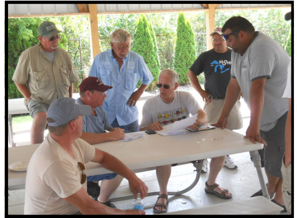
DAS & Metro-West negotiating the Fish-Off