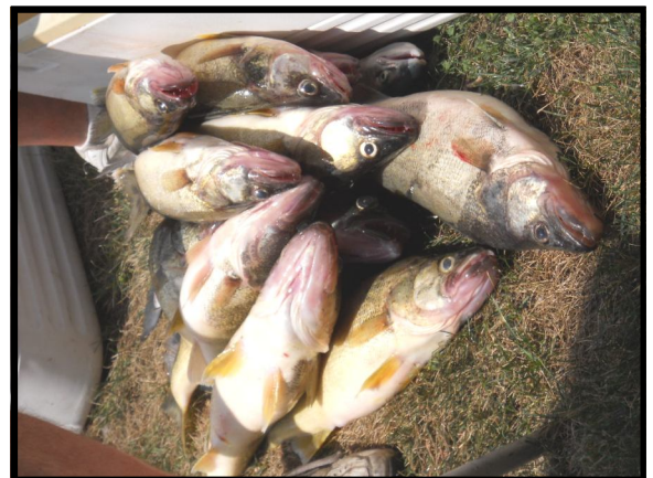
A mess of Walleye caught aboard "Sea Hag"