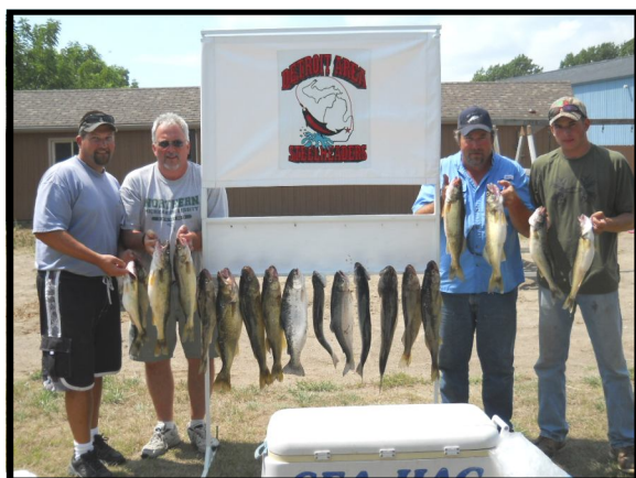
3rd Place - "Sea Hag"