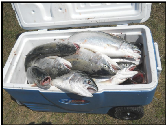
Nice cooler full from "Blue Horizon"