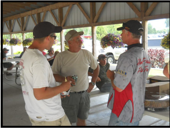
Swapping lies under the Pavilion