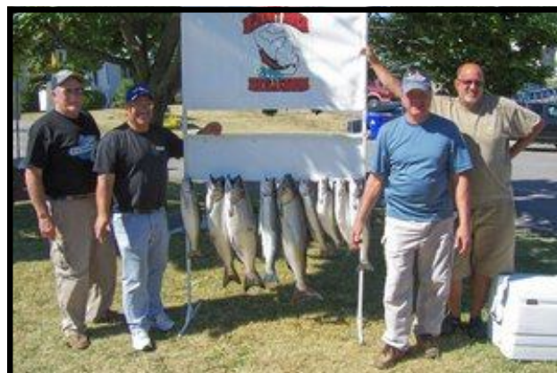
4th Place - "Bad Dog"