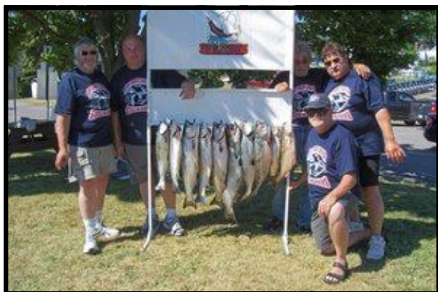
3rd Place - "Sloppy Joe"