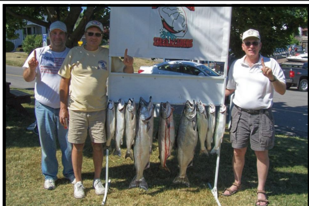
1st Place - "Vicki's Seacret"