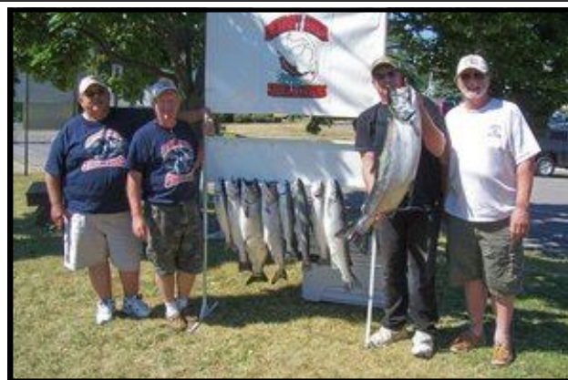
2nd Place - "Bobby's Toy II"