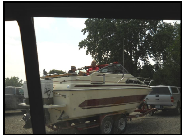
Bruce Tufford & crew watching the weigh-in in comfort