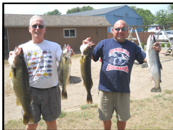
5th Place - "Vicki's Seacret"