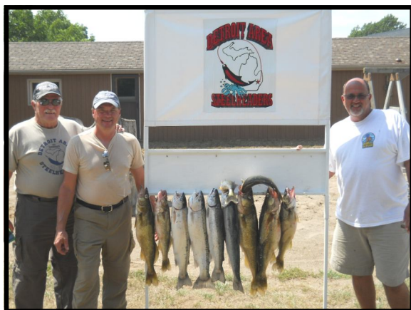
1st Place - "Blue Horizon"

LTSM = Late To Skipper's Mtg. LTWI = Late To Weigh-In 1NFC = No Answer 1 Fish Call 2NFC = No Answer 2 Fish Calls UCC = Unauthorized Crew Chg. DQ = Disqualified