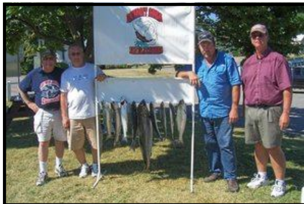
5th Place - "Sea Hag"

All Olcott photos courtesy of Bob Feisel