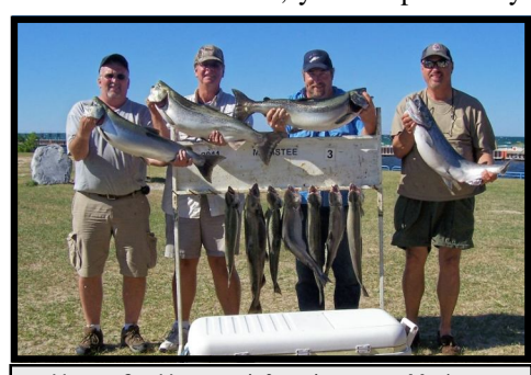
Here's 'Sea Hag's catch from last year's Manistee tournament. Be sure not to miss out on all the action!

This tournament is the last of three "333" contests. For $20 entry fee for this tournament, you can pick out your 3 heaviest fish to