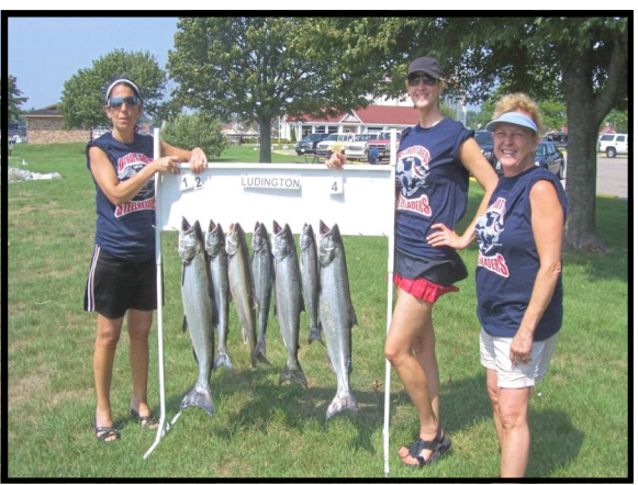
4th Place - "Bad Dog"