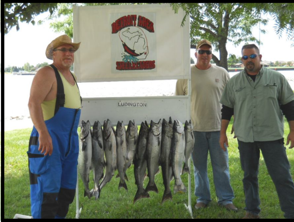
3rd Place - Thor's Hammer"