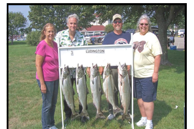
3rd Place - "E-Fish-N-Sea"

All Ladies Day photos courtesy of Bob Feisel