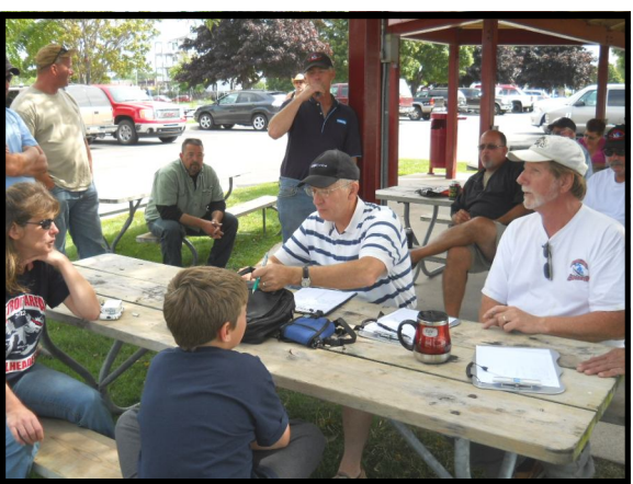
B.S.'n about Fish