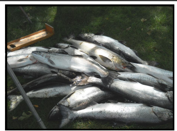
1st Place - "Almost Paradise" - Nice Mess Of Fish