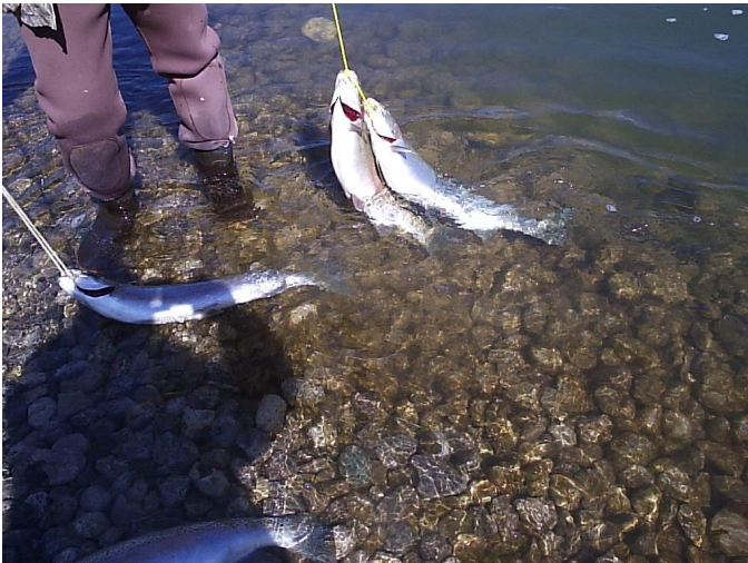
A Close-up of the Harvest