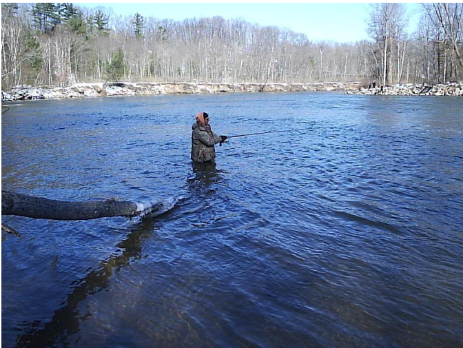
Gaspare Workin' for Those Fish