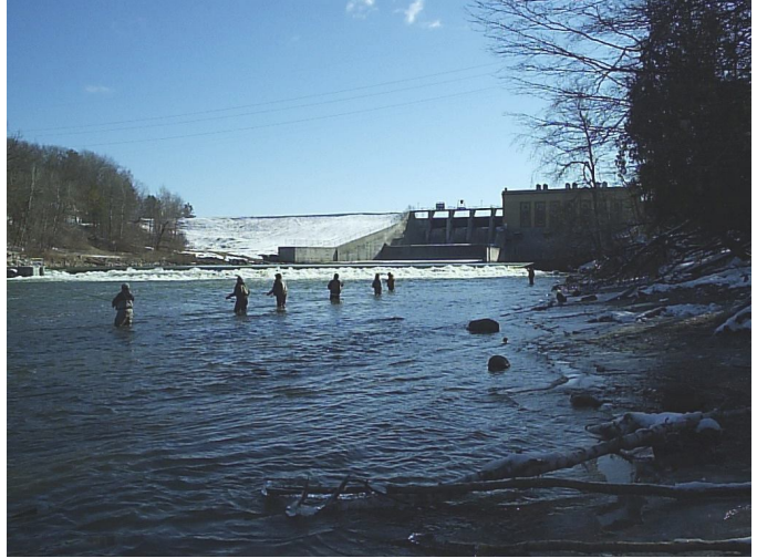
The Boys Lined up at the Dam