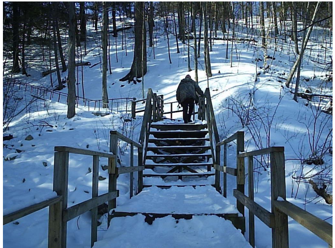
The Long Walk up the "Luge" to the Parking Lot