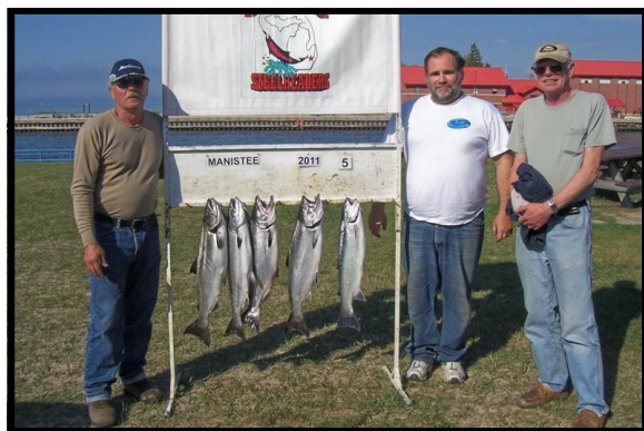
5th Place - "Big MaMa"