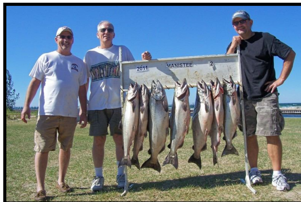
2nd Place - "Vicki's Seacret"