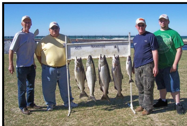
4th Place - "Bobby's Toy"