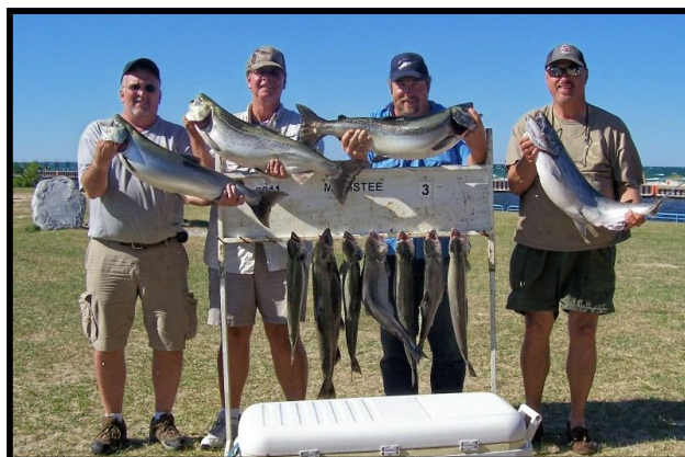
3rd Place - "Sea Hag"