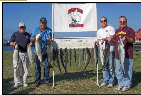
2nd Place - "Sea Hag"