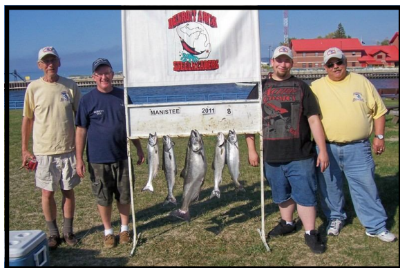
8th Place - "Bobby's Toy"