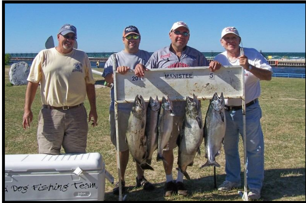
5th Place - "Bad Dog"