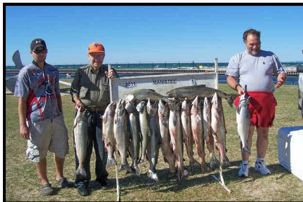
1st Place - "Almost Paradise"