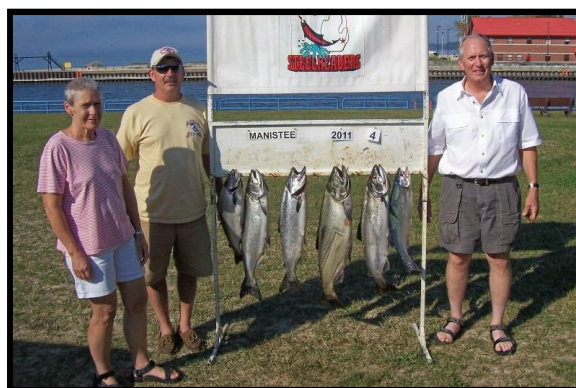
4th Place - "Vicki's Seacret"