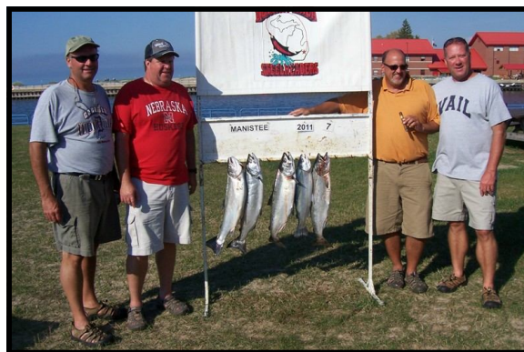
7th Place - "Bad Dog"