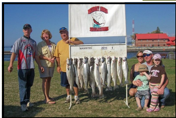
1st Place - "Almost Paradise"