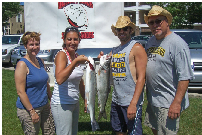
4th Place - "Thor's Hammer"