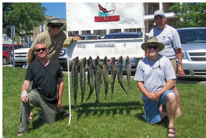
1st Place - "Sloppy Joe"