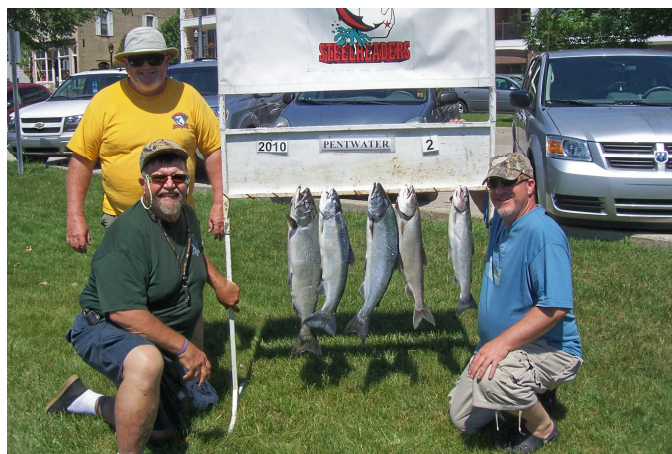
2nd Place - "E-Fish-N-Sea"