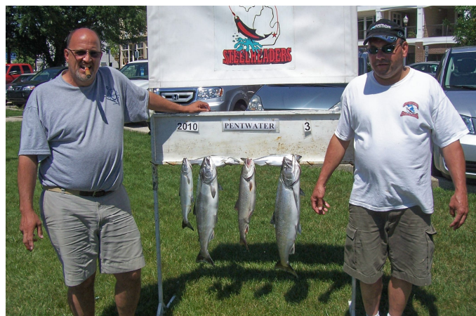
3rd Place - "Bad Dog"