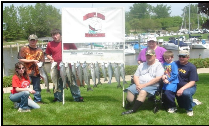
1st Place - "Miss Dipsey"