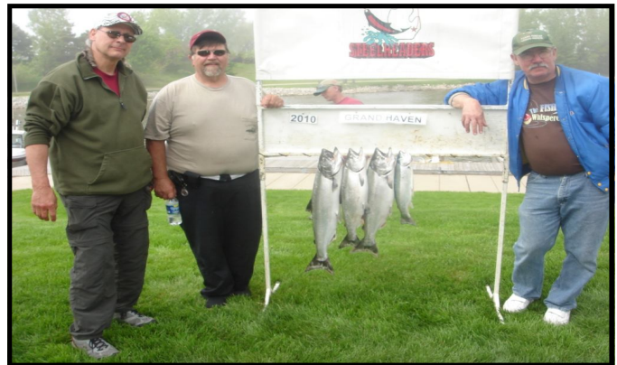
2nd Place - "E-Fish-N-Sea"