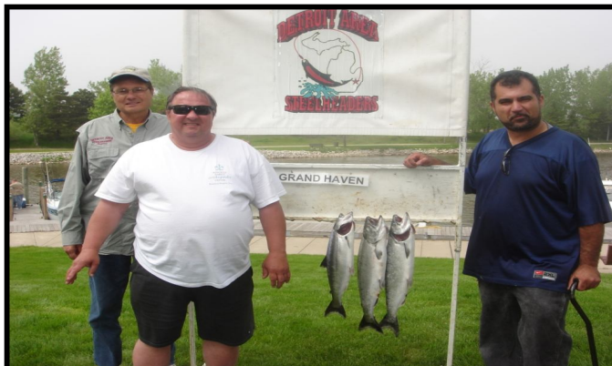
11th Place - "Lucky Strike"