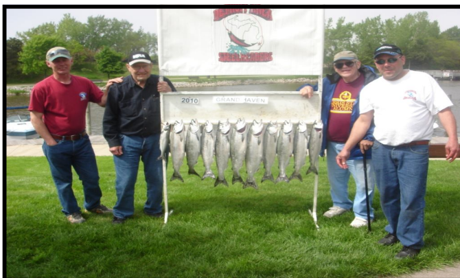
6th Place - "Almost Paradise"