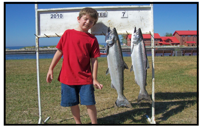
7th Place - "Miss Dipsey"