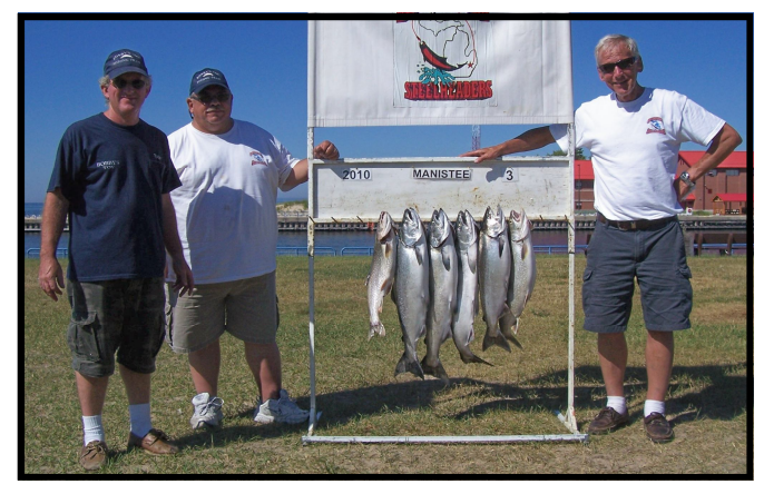
3rd Place - "Bobby's Toy"