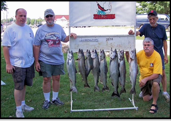
2nd Place - "Sloppy Joe"