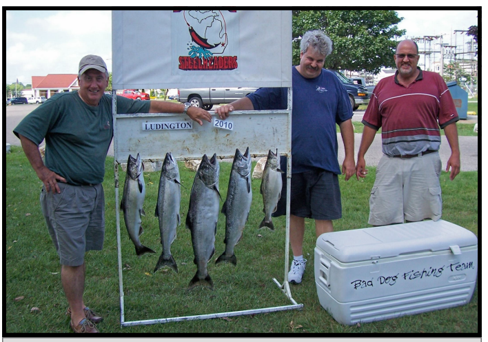
3rd Place - "Bad Dog"