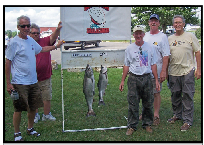
4th Place - "Bobby's Toy"