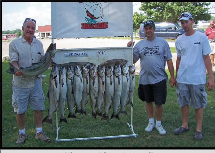
1st Place - "Almost Paradise"