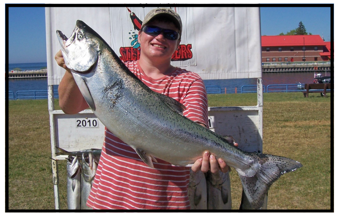
Big Fish - 17.35# King - "Almost Paradise"