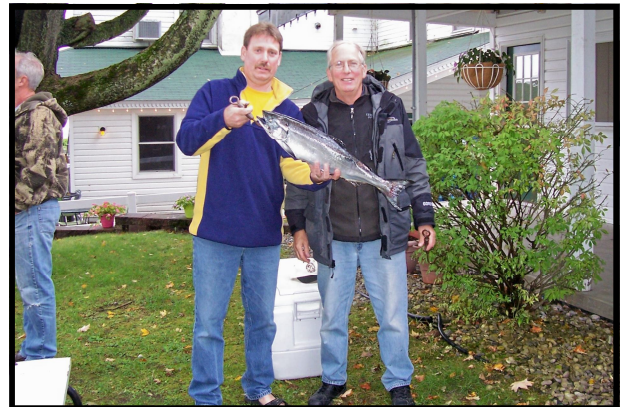
4th Place - "Vickie's Seacret"