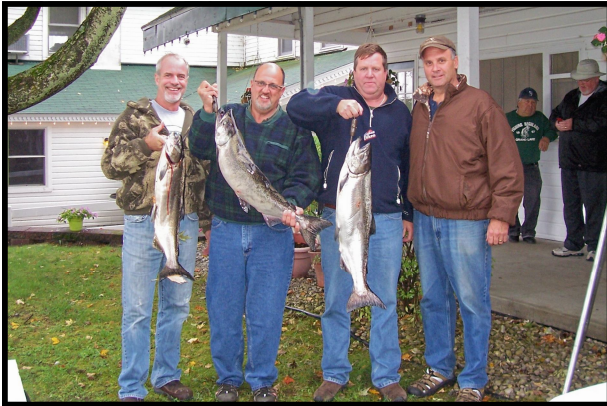
1st Place - "Bad Dog"