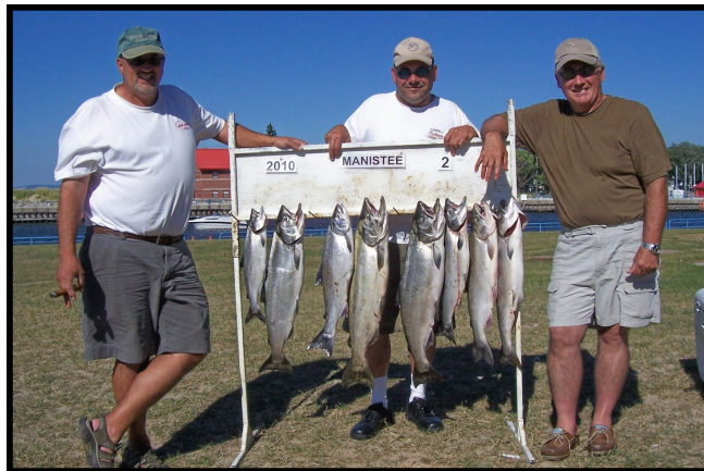
2nd Place - "Bad Dog"