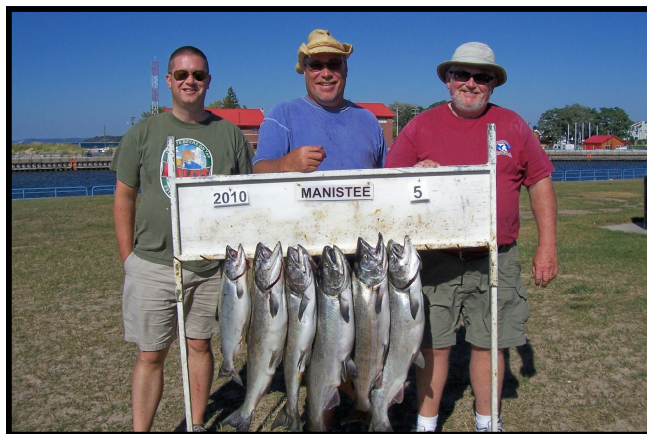
5th Place - "Thor's Hammer"