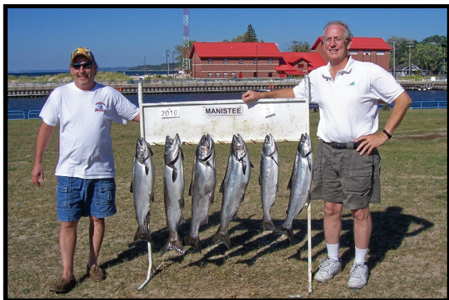
3rd Place - "Vickie's Seacret"