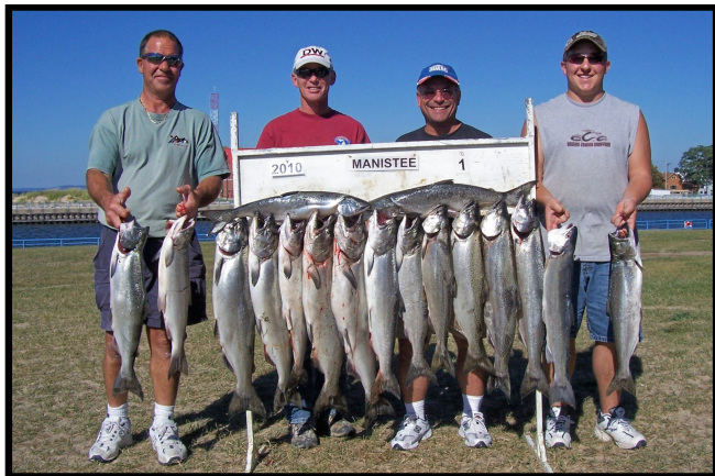
1st Place - "Almost Paradise"