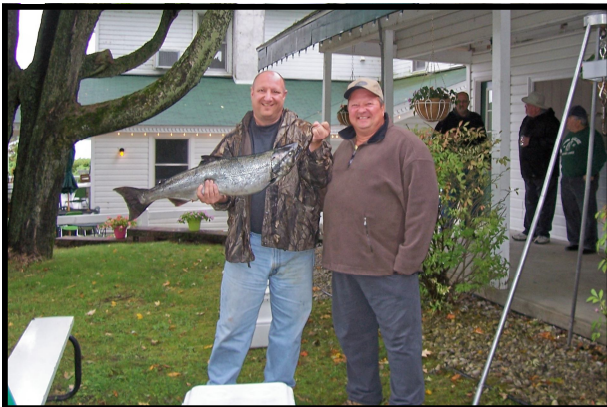
3rd Place - "Lucky Strike"