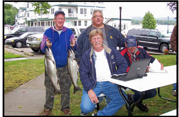
2nd Place - "Bobby's Toy"