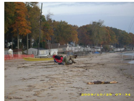
Don't let anyone fool ya, Surf Fishin' can be Hard Work!