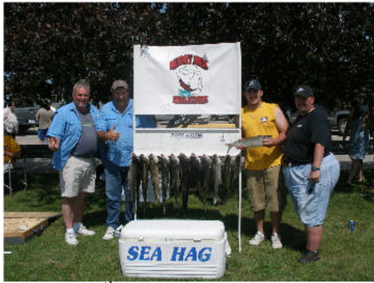
1 st Place – Sea Hag