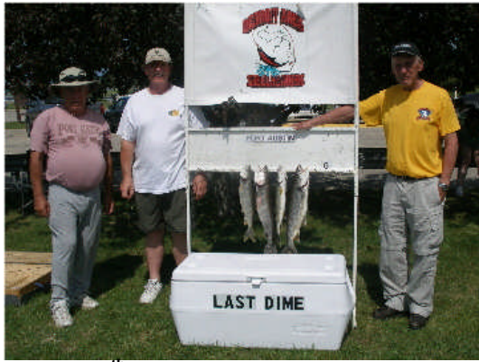
6 th Place – Last Dime