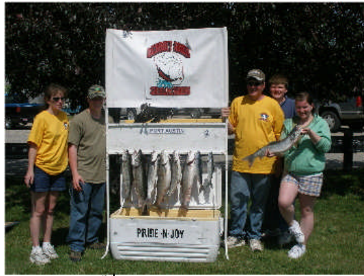
2 nd Place – Pride N Joy