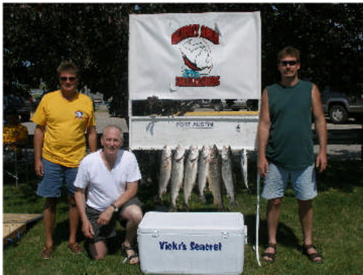
4 th Place – Vicki's Secret