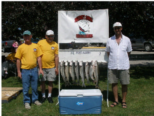
3 rd Place – TNT