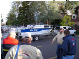
Blaise Pewinski & "Sea Hag"