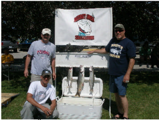
7 th Place – Thor's Hammer