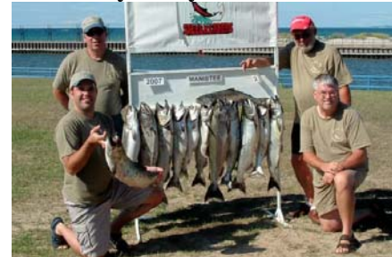
2nd Sloppy Joe 134.50