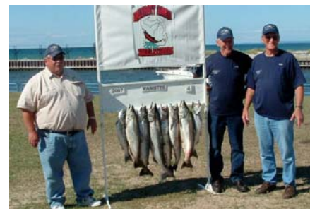
4th Bobby's Toy 123.65