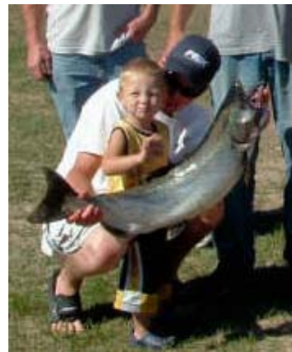
"But Dad, I caught it not you!"