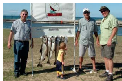
6th Thors Hammer 84.65