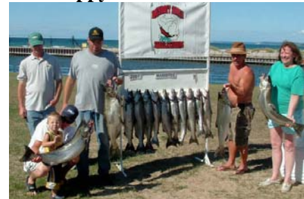
1st Almost Paradise 139.15