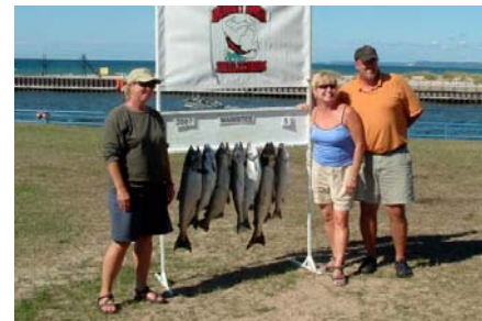
5th Bad Dog 89.15