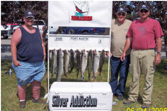
Silver Addiction – 2 nd Place