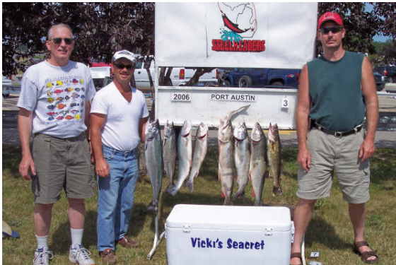
Vickies Seacret – 3 rd Place