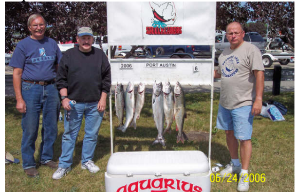
Aquarius - 6 th Place