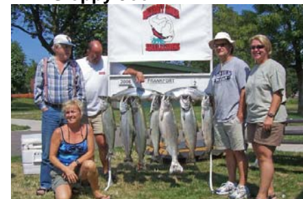
2 nd – Bad Dog