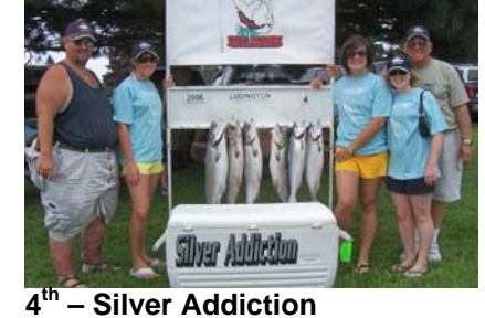
4 th – Silver Addiction