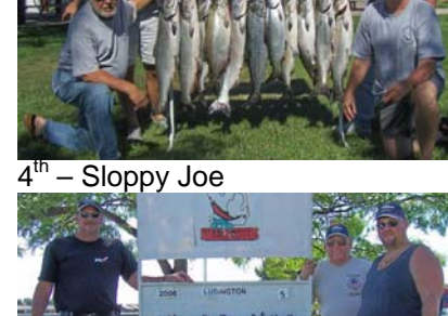
5 th – Silver Addiction