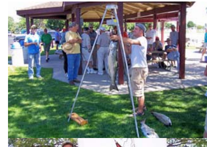
1 st – Blue Star