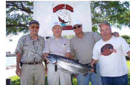
Big Fish – 21.80# - Dredge

Ludington Ladies Day Below are the unofficial results of the 2006 Ludington Ladies Day Tournament.