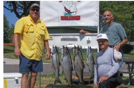
4 th – Thors Hammer