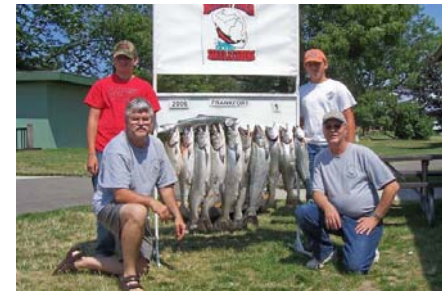
1 st – Sloppy Joe