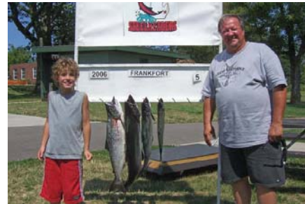
5 th – Lucky Strike

Ludington II Below are the unofficial results of the 2006 Ludington II Tournament.