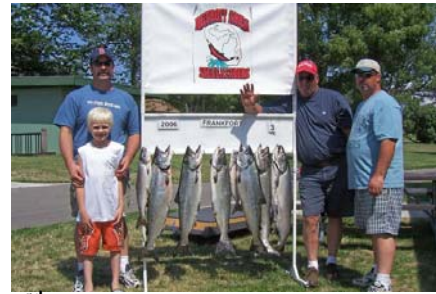
3 rd – No Limit