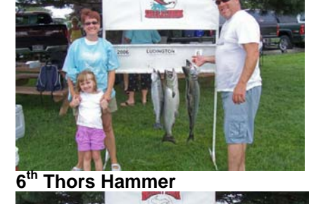
6 th Thors Hammer