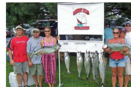
1 st – Outta Line

Big Fish 22.10# King, Bad Dog, also $45.00 Big Fish Pool winner.