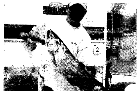
"FREE BIRD" claimed both Big Fish Pools at Grand Haven to cap a fine weekend!