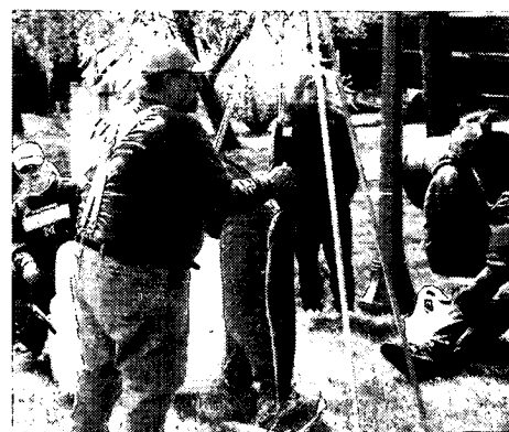
THE TOURNEY WEIGH-IN is a popular spot for socializing and camaraderie!