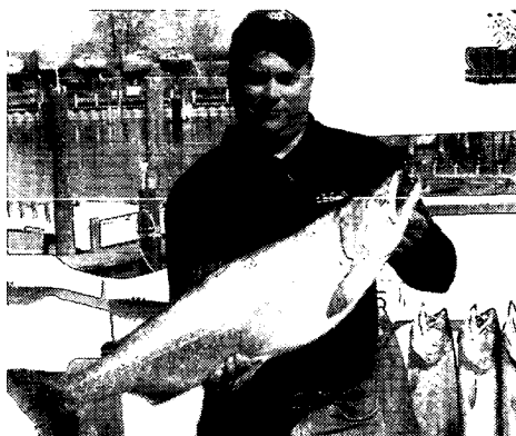
THIS NICE KING SALMON was good enough for first place in the Big Fish Pool.